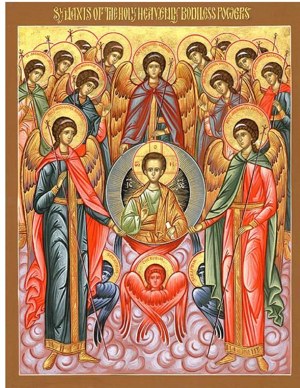
THE HOLY ARCHANGEL MICHAEL AND ALL ANGELIC POWERS – November 8 th –

Thank you for your support of your Churches!