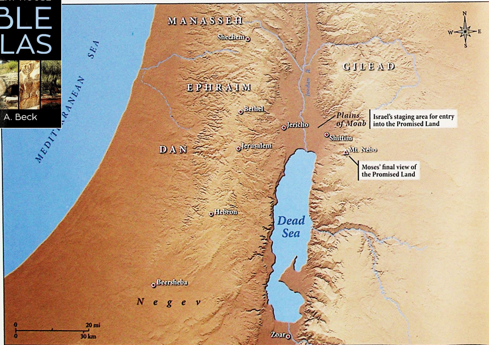
Map 3.6—The Plains of Moab and Mount Nebo