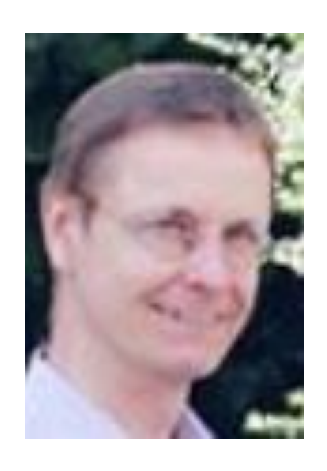
Cursed is anyone who trusts money or job!