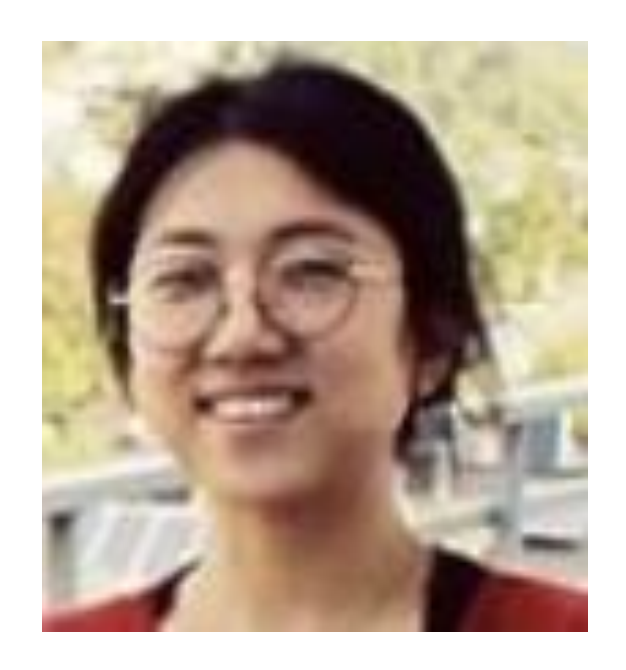
Cursed is anyone who posts on Instagram for human recognition!