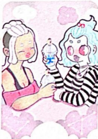
Two of Cups

Reversed: Thankfully, the Two Of Cups reversed is not a card that indicates a situation that is too difficult to turn around again. There's some friction with someone in your life that can be repaired through better communication and listening. You are feeling misunderstood, and so is the other individual involved. When this is the case, you might begin to develop more feelings of mistrust and separation. With mutual effort, however, this situation can be talked out and worked on. Fixing a strained relationship at this stage is still a possibility.