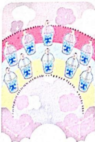
Ten of Cups

Reversed: The Ten Of Cups helps lift any heavy energy from other cards in a reading. Because things are going wonderfully well, become cautious of nit-picking little details to the point that they seem more significant than they actually are. Especially when this involves another person or something that is out of your control. Life is too good and too short to stress about these things.