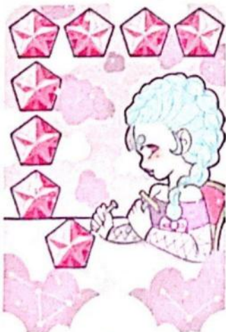
Eight of Pentacles

Reversed: You're growing increasingly impatient in your current situation and might be inclined to try and take some shortcuts to success. But because you do not have the experience or skill level to advance, you inevitably will be pushed back. The Universe knows better than that. If you lack focus and ambition, you might have strayed too far away from your path. Get back on track ASAP. Remember to make sure that you still love what you do.