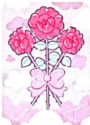
Three of Wands

Reversed: Through making the necessary adjustments and rigorously reviewing your work, you can confidently open up to others about what you've been working on, but beware that even though you have meticulously planned everything, there might still be unforeseen delays or mishaps. Try not to let that ruin your mood, and continue to follow the path that inspires you.