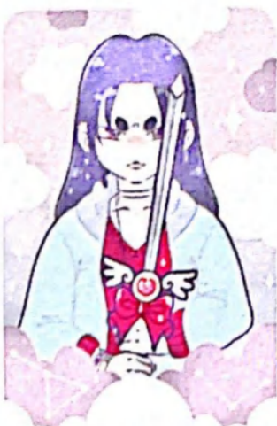
King of Swords

This is a time in which your focus must be realigned towards positive, meaningful interactions rather than surface-level chatter.