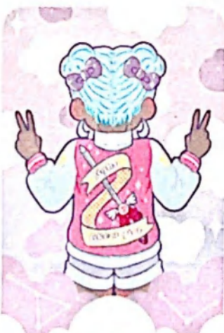
Knight of Swords

Reversed: Uh-oh! When angered, your words cut deep, and you've lost your sense of diplomacy. Whoever happens to be in your line of fire better run or duck! Once you've voiced your opinion, it isn't unusual for you to withdraw and become cold towards the people around you. If this card appears in reverse during a reading, know that your choice of words matters. You cannot unsay something nasty that was said during a fight, and with the ego getting involved, you may find it hard to bury the hatchet and instead choose to wait until the other person attempts to make amends. Try to temper yourself as much as you possibly can. Maybe it's time to be the bigger person.