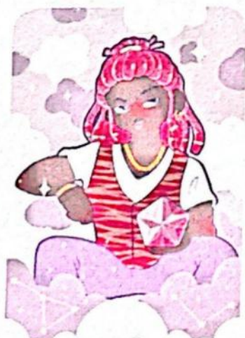
King of Pentacles

Reversed: When reversed, be extremely cautious when doing business with this person. When imbalanced, the King Of Pentacles can be deceitful and materialistic. You are better off working with someone else or waiting for a new opportunity to arise. Listen to your intuition and keep your eyes and ears open.