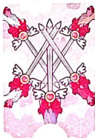
Five of Swords

to a close friend, or consider seeing a professional. You don't have to go through this time alone unless you truly want to.