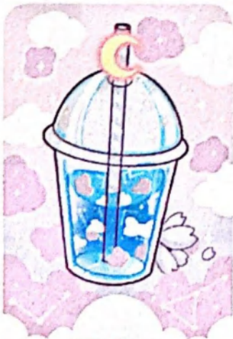
Ace of Cups

Reversed: It's often best not to expect a particular outcome or type of treatment from other people, especially when you're just getting to know them. When it comes to love, getting your hopes up too high can mean that there's more room for you to fall. Place some extra padding around your heart and soul to help cushion any hits, just in case a potential relationship goes sour. Be content in your current situation, and enjoy the moment instead of putting any energy into planning the future.