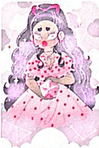
Queen of Pentacles

Reversed: Always make sure you are aware of the price you've agreed to pay. Whether in association with a mentor, business partner, or material object, transparency is crucial to avoid nasty surprises and discrepancies in expectations later down the line. Especially in situations where large sums of money or people's livelihoods are at stake, the environment can quickly turn sour. Trust nobody and, if necessary, draw up contracts and get lawyers involved to protect yourself.