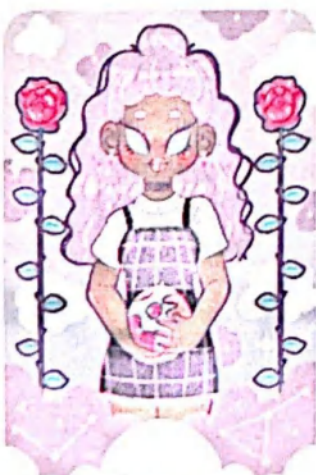
Two of Wands

focused on another project, it's expected that something else may go unnoticed until it's literally right in front of you. Gently bring your awareness back to the big picture every so often to help you see things from a higher perspective.