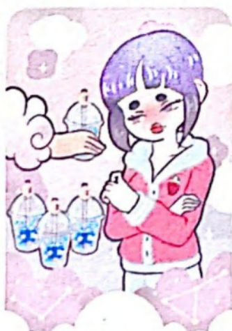
Four of Cups

Reversed: Feeling unhappy or disappointed about your situation strips you of your usual optimism and zest for life. To overcome feeling this way, you must be honest and, in a way, also very tough with yourself. After all, you are only the victim of a situation if you allow yourself to become one. Therefore, if you've been putting the blame on your circumstances, this is a much-needed reality check. Remember to take responsibility for your life, as you're in charge of your existence. You do not need to simply settle for anything or anyone that you cross paths with. You have a choice. Actively choose to move towards happiness with each one of your decisions.