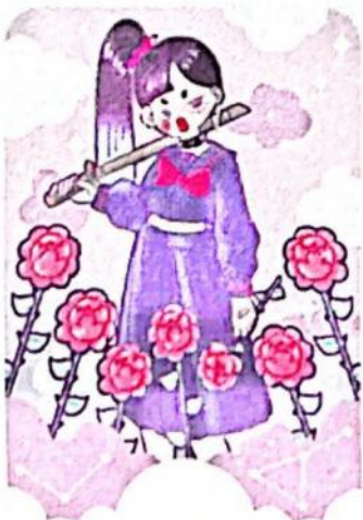
Seven of Wands

Reversed: Other people's opinions are encroaching on your dreams. This can cause you to feel confused, especially when the evidence against your path comes from a respected source. Try not to allow doubt to further instill insecurity in you. Nobody in this world really knows what the future will hold or whether they have made all the right choices in life. So don't put that type of pressure on yourself; it's not worth it.