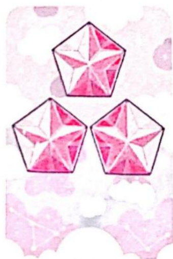
Three of Pentacles

Reversed: Don't worry about whether or not a business relationship will work out before even giving it a try. If there's money involved in a project, draw up a contract to protect you and provide you with peace of mind so you can solely focus on the tasks at hand. Get a lawyer involved if needed. There's no harm in making sure you are being safe rather than later being sorry. After all, to expand, you have to step out of your comfort zone and collaborate with others. When your mind is at peace, it becomes much easier to absorb new information. If you feel like your environment fails to properly inspire you, surround yourself with people or the works of people who motivate you (think books, podcasts, documentaries, etc.).