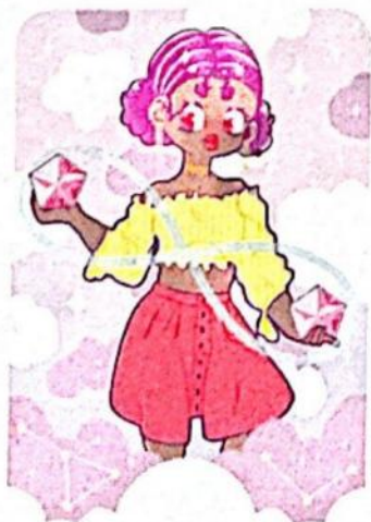
Two of Pentacles

Reversed: Personal responsibilities and multiple jobs or projects on the go can make it hard to be decisive or find a proper balance. Chances are, you're overworked and not spending enough time relaxing. Take some time to prioritize what must be done and what just slipped onto your to-do list that isn't necessarily urgent. Find more value in balance, regardless of how glamorized being overworked is made out to be within our society. Long-term stress can develop into serious health implications and should be avoided altogether.