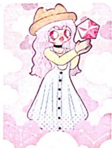
Princess of Pentacles

Reversed: When reversed, the Princess Of Pentacles turns spoiled and entitled. On the surface, laziness and lack of focus have taken over. But the root of the issue often remains hidden; fear of failure or insecurity is causing the lack of enthusiasm and progress. Some serious self-love is necessary right now, including the time to rebalance the body's energy centers, also known as chakras.