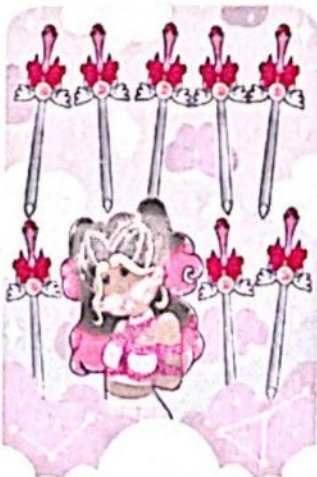
Eight of Swords

Reversed: Being in denial can make everything so much worse. Try not to sweep things under the rug or have your ego stop you from asking for help when you feel you need it. You need to be courageous enough to help yourself and use the tools available to you. If you fail to act appropriately, you may find that more and more issues are drawn into your life.