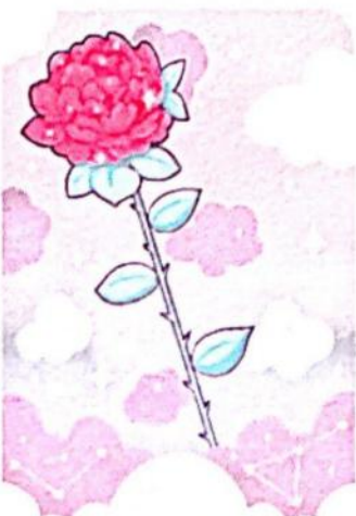
Ace of Wands

Keep your personal motivation at the core of your work to avoid too many roadblocks. Do what you feel called to do, not what someone else has planned for you.