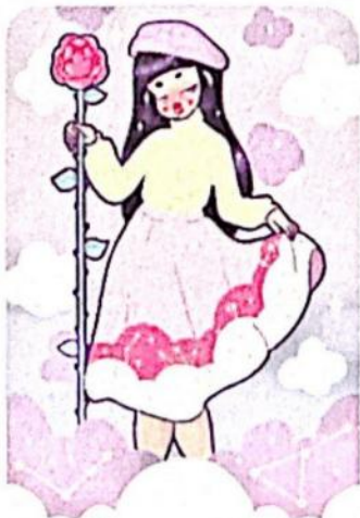
Princess of Wands

Reversed: Try not to grow impatient with other people or your projects. You might feel like rushing into making a decision so you can move forward, even if it goes against your intuition. To avoid setbacks, you are being called to smarten up and be reasonable. High-quality service, successful business ventures, and solid relationships need time to develop. Trying to mess with procedures will ruin the entire affair. When reversed, the Princess Of Wands might also be presenting you with some undesirable pieces of information. Messages of impending delays and unforeseen hindrances are not unusual.