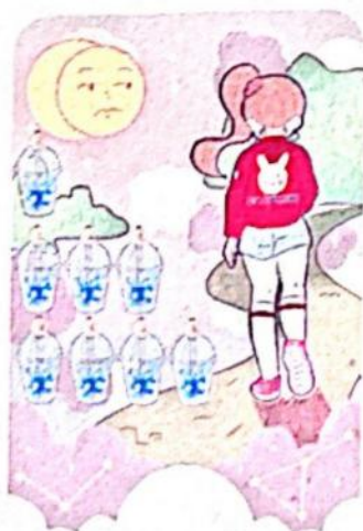
Eight of Cups

Reversed: Deal with it! No more excuses as to why you cannot remove yourself from a toxic relationship. You are trying to justify your own lack of courage, but the Universe is saying no. Show yourself some love and do what you know is best for you. Depending on who is giving you life advice, you might want to kindly nod and continue on your way regardless of what they say.