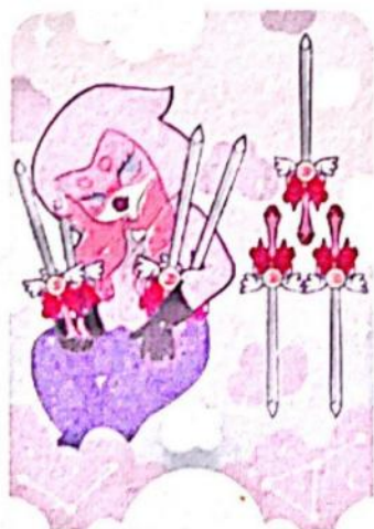
Seven of Swords

Reversed: While being diplomatic and proceeding logically is represented in the Seven Of Swords, there is a whole other meaning to this card. Reversed, the Seven Of swords card indicates a possibility of deception and dishonesty. Someone withholding vital information from you but telling themselves that their actions are 'justified' as they are 'not actively lying to you'. Stay flexible and docile to avoid heated discussions. There's no point in trying to reason with a corrupt person. Instead, play the game and beat them at it.