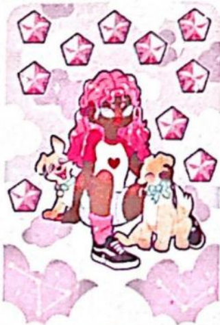
Ten of Pentacles

Reversed: Ensure that if your work life has come to a plateau, you are still challenging yourself personally. Financial success and stability are superb; however, even the most idyllic situation will eventually get monotonous and dry. Keep your mind and body active each day to avoid getting old before your time or making impulsive decisions that you will end up regretting.