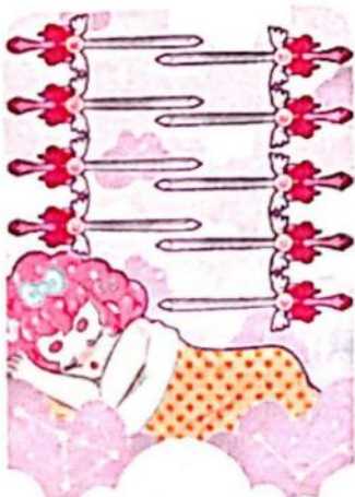
Nine of Swords

Reversed: You're going through a difficult time, and there is no way to sugarcoat this fact. Like any other challenging situation, this too shall pass. Devote more time to self-reflection and alleviating your pain. Write down what you're feeling and thinking. Allow this fatiguing period to foster and generate in you a greater sense of appreciation that you may continue to embrace, even when things eventually turn around again for the better (they always do).