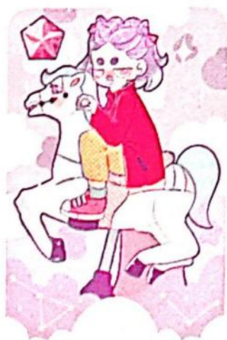
Knight of Pentacles

Reversed: Lack of motivation brings out the worst in the Knight Of Pentacles. Without a reason to keep striving, the Knight Of Pentacles produces a growing list of missed opportunities. Becoming increasingly uninterested in employment, personal growth, and travel isn't uncommon. Money problems rapidly approach when the Knight Of Pentacles have lost their way.