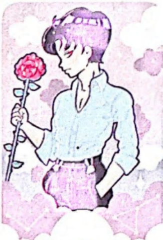
King of Wands

Reversed: Uh-Oh! Encountering the King Of Wands, also known as 'King of Fire' reversed, implies that the situation is pretty unpredictable. You're all over the place and do not know where to put your energy. When managed properly, you can redirect your focus onto a creative project. However, when left ignored, the situation can result in unnecessary arguments and restlessness caused by a lack of direction.