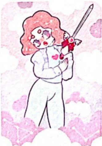
Princess of Swords

Reversed: This is not a comfortable situation to manage where boredom or spitefulness can turn an energized thinker into a destructive being. When under-stimulated, the Princess Of Swords can quickly lose its motivation and drive. It can be difficult to turn things around as a lack of discipline is involved, and deep-rooted insecurities are holding off success. With too much time to overthink, the Princess Of Sword's mind can venture into dark places, so it's best to keep them occupied and inspired at all times. This person's ability to focus is excellent, as long as they are engaged in a unique challenge.