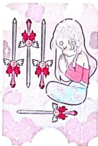
Four of Swords

Reversed: You're not listening to your body, despite its attempts to communicate with you. If you continue to overwork yourself, you might put yourself in some serious danger or even drive yourself to experience a challenging kind of spiritual awakening. The longer you refuse to rest and listen inward, the longer your road to recovery will be.