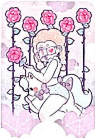
Six of Wands

Reversed: You're impatient because of delays in your plans for success. Not only do you feel agitated, but in a way also betrayed. You expected to successfully keep to your timeline, but circumstances outside of your control made this impossible. You're tempted to force the missing piece into a space in which it will never properly fit, which is just causing more unnecessary strain. Try to be more reasonable with your expectations for a situation that lies outside of your control.