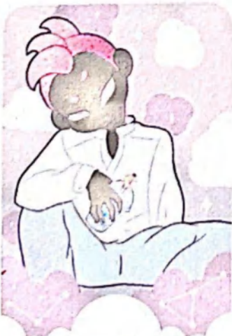
King of Cups

Keep promises that you have made and recognize that success does not come without hard work and responsibilities. Making others feel important and taken seriously is just as essential. Wanting to have your cake and eat it too is only human, so keep yourself in check.