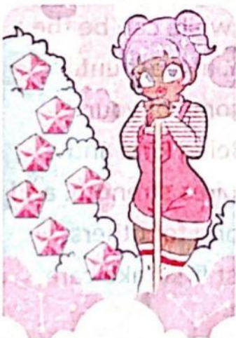
Seven of Pentacles

Reversed: If you find yourself feeling like you live to work and pay bills and other debts, it's time to take a hard look at the choices you've made and continue to make. In which areas of your life can you cut back to save money? What financial decisions are you ashamed of? Do you need to adjust your money mindset because caring about public perception has caused you to spend money unnecessarily? If you find yourself acquiring material goods to impress other people or portray a particular image, you will hit a roadblock sooner rather than later.