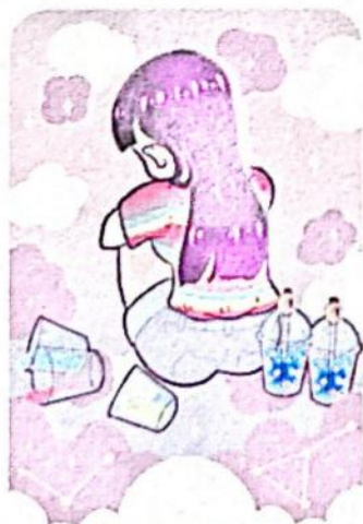
Five of Cups

Reversed: Embrace your past, even if you feel like you've made many unnecessary mistakes in your life. We all have. If you're finding it difficult to forgive yourself for past mishaps and keep your head up for a bright future, turn to things that you know will cheer you up and motivate you. This could be a person who has succeeded, even in the face of tremendous personal struggles, or an activity that reminds you of how beautiful life can be. Focus on the light in your life.