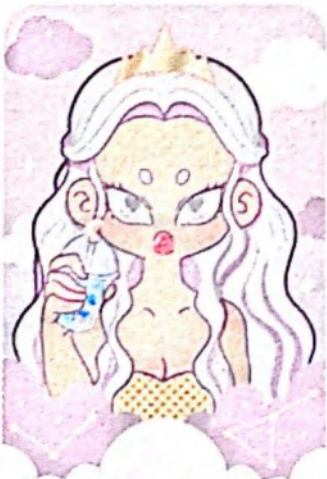
Queen of Cups

Reversed: What started out as feeling butthurt can escalate into full-blown grudge-holding. The Queen Of Cups indicates being very picky with who you choose to forgive. Sometimes, it feels more comfortable to stay mad. In moments like these, remind yourself that denying forgiveness is mostly harming yourself. Think of it as giving yourself the gift of forgiveness rather than condoning someone's bad behavior. Acceptance and taking the high road is what you really want to do. Don't let stubbornness and cynicism stop you from becoming your highest self.