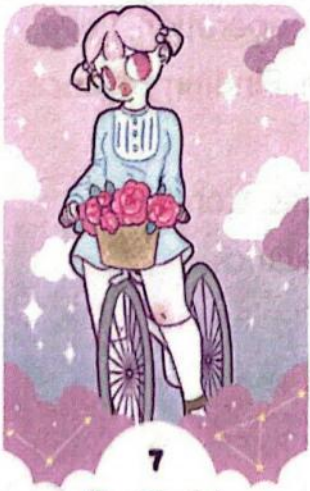
7 The Chariot

Enjoy this wild ride, filled with self-empowerment and stamina. Yes, things are moving at the speed of light, but don't let the pressure get to you; you're on the right track. Fortunately, you victoriously avoid any roadblocks and can overcome obstacles through your laser focus. Your eyes are locked on your goals. The Chariot is generally a favorable foretell and speaks about your triumphant ways of overcoming any challenges that lie ahead. Even when reversed, The Chariot remains promising, as you still have the chance to steer two opposing forces in the same direction. Breathe, meditate, or do yoga whenever you feel like you're losing your composure. After all, you're in the driver's seat.