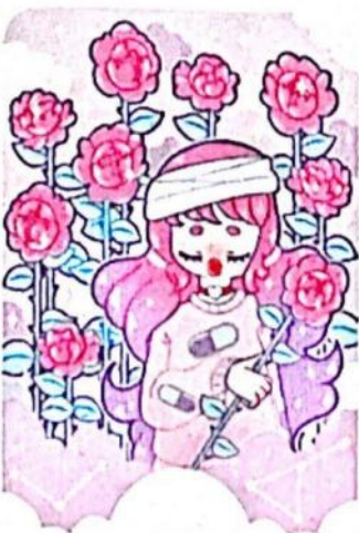
Nine of Wands

Reverse: If you feel like your current approach hasn't been fitting, it might be time for you to move on or find a different strategy to follow. This is difficult to do when time, money, and the ego are invested in a situation or venture. Nevertheless, you cannot force success or harmony. If it hasn't worked out till now, it probably isn't meant to be. Don't feel disappointed and most certainly do not take things personally.