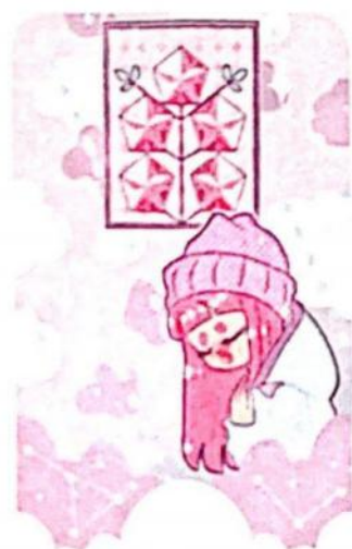
Five of Pentacles

Reversed: Play it safe and know that through hard work, determination, and perseverance, you are slowly but surely turning things around for yourself. Know that one day, you'll think back on this difficult time and be grateful for what it taught you. Money can't buy your respect or affection, and you are cautious of any obscure sales tactics that others may try to apply to you. Your slow and steady approach will pay off. Don't compete with anyone other than yourself.