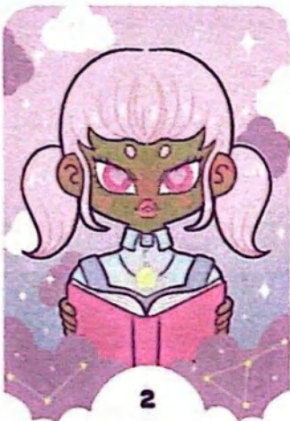
The High Priestess

Things are getting interesting! When The High Priestess appears, know that something will be brought to light, which has remained a mystery until now. A wise and knowledgeable figure, The High Priestess, intuitively knows when the time has come for another layer of truth to be revealed. This hyperawareness of the spiritual realm encourages you to trust your sixth sense and regularly touch base with it. Furthermore, this card's appearance may also indicate an attempt to hide important information that must be told. Be wary of people who are being deceitful and watch out for situations in which you feel rushed or pressured to make a decision. Pause and take time to reflect. Divine answers cannot be hurried. If you feel it's necessary, distance yourself from the person or situation to tune into your sacred knowledge. Make time to educate yourself by reading, listening to podcasts, or watching insightful documentaries.