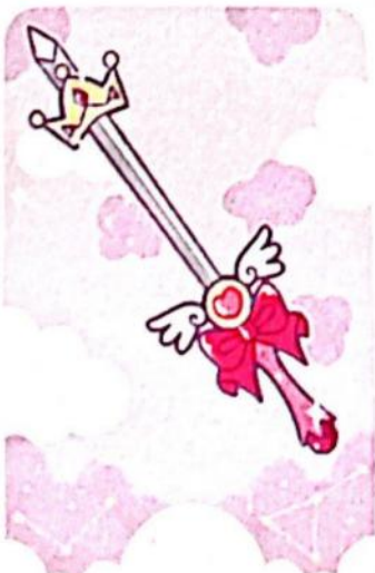
Ace of Swords

Reversed: When reversed, this card forecasts a delay in your plans. This might leave you feeling frustrated and confused about why your ideas have yet to manifest into physical reality. Practice patience and clear communication when using the powers of the Universe. In an attempt to manifest your wishes, ensure your energy is cleansed and that you are focusing on what you desire, not what you are trying to avoid. Remember that where your mind goes, your energy flows.