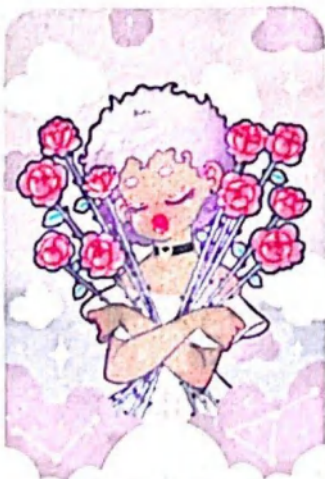
Ten of Wands

There's nowhere to hide or any way of avoiding these struggles. Release any tension and drop into a space of healing, even if there is some residual pain involved.