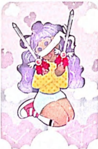
Two of Swords

confident in your choices. Whatever you do, make sure that you aren't procrastinating making decisions due to being in a state of fear, anxiety, or panic.