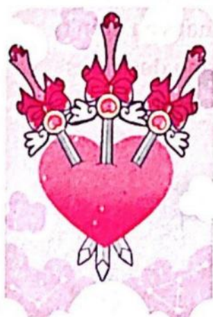
Three of Swords

Reversed: Don't beat yourself up about it! Commit to self-care and some good rest. Try not to blame yourself, another person, or the circumstances in which the separation took place. The more you refuse to let go, the more pain you end up causing yourself. Once in motion, an inevitable breakup cannot be stopped. Therefore get out of the line of fire and save yourself from unnecessary emotional (or physical) injuries.