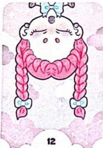
The Hanged Man

When you feel disconnected from things you used to hold sacred, know that The Hanged Man guides you to follow a less materialistic way of life. Superficial pleasures and relationships don't hit the spot like they used to anymore, and it becomes clear that you are opening yourself to new perspectives. Quite literally, The Hanged Man dangles upside down, not because he must or is forced to, but because he can see the same picture from a different perspective by doing so. He is comfortable and patient with himself, which allows him to pay more careful attention to his inner journey. When this card appears, you find yourself at a crossroads and in need of readjustment. Don't make the mistake of holding on to the temporal realm, and instead, dive into deep meditation and be gentle with yourself. There's no need to rush: You are exactly where you need to be!