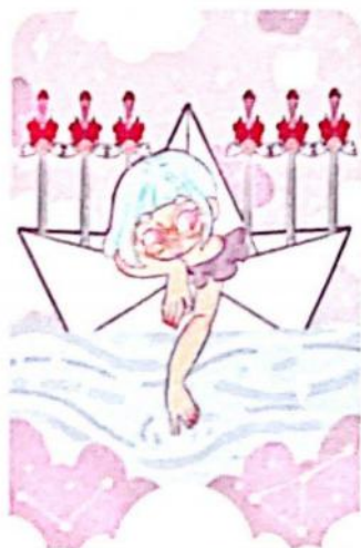
Six of Swords

Reversed: There might be some roadblocks or delays that are prohibiting you from making any progress. When you feel like you cannot take the next step forward, don't hesitate to openly communicate about what you are going through with your family or friends. They may be able to suggest solutions you never considered and simultaneously help you express yourself more freely.