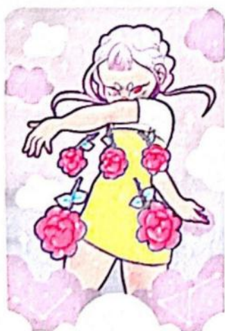
Five of Wands

Stay away from anyone who has no boundaries. There's no winning when such individuals are involved, just conflict and further impediments. It's not worth your precious time or energy.