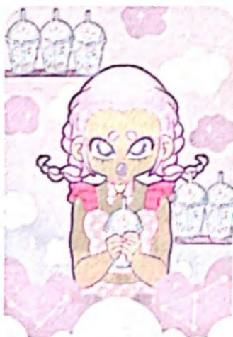
Six of Cups

certainly will not let you travel back in time or create any new memories. Work on finding a current identity you feel comfortable with to help you let go of what no longer serves you.