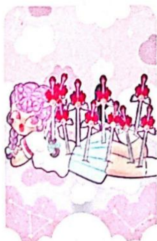
Ten of Swords

Reversed: Let it go! Quit trying to please everyone or go back in time in an attempt to make better choices. What's happened has happened, and the only thing left to do is learn from your past mistakes. Try not to obsess about the past and instead focus on releasing it wholly. Making excuses for yourself or another person will only make matters worse. Be real with yourself, even if it hurts. Only then will you be able to receive abundance again.