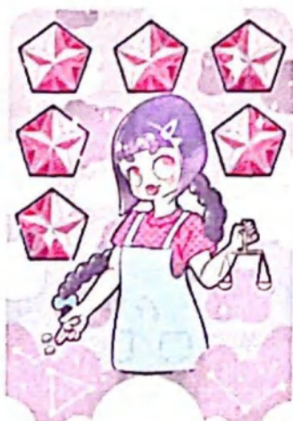
Six of Pentacles

so, turning to merely minding your own business for a while can be the healthiest approach, at least until you have restored some of your personal balance. Being kind and compassionate requires strength, and to be able to be strong for others, you sometimes must first take care of yourself.