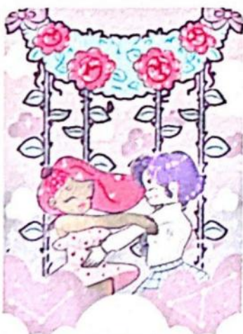
Four of Wands

Reversed: Even when reversed, the Four Of Wands remains a highly favorable card to receive during a reading. But instead of openly celebrating, as the upright position of this card suggests, you are rejoicing in a more private setting, possibly for security reasons. You want to avoid too many people grasping the exact amount of success you're having, as you understand that some may try to take advantage of your situation. This is the wise thing to do, your modesty will keep you and your possessions protected.