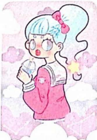
Knight of Cups

It can be painful to come to terms with the truth, especially when it involves strong feelings that seem to be one-sided. The right person will not make you beg for their commitment: So, get off your knees!