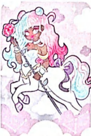
Knight of Wands

Reversed: You're moving quickly and with ease; however, not everyone you're involved with is in the same position. And because you are dependent on some people to deliver their end of the bargain, it can be frustrating when they fail to keep their promises. With the Knight Of Wands being connected to the element of fire, you're already in an irritable space to begin with, so adding fuel to your fire can easily cause you to blow up. Try to keep some water nearby just in case something sets you off, and you need to take a dip to cool yourself down.