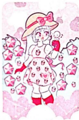
Nine of Pentacles

Reversed: No matter how fortunate your situation is, you still feel like something is missing. You may jump to buying gaudy things you don't need in an attempt to fill the void. In some way, shape, or form, you still feel like you depend on someone else to make you feel complete. It's time for you to come to the realization that you must go inward instead of continuing to look for answers on the outside. No amount of money or social status can buy inner peace.