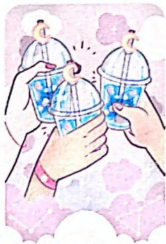
Three of Cups

Reversed: Get ready for some serious romance. In this position, the Three Of Cups often indicates a more sensual experience involving a romantic partner. You are getting to know someone on a deeper level, which is beautiful but also very personal. When this card shows up reversed, understand that the ongoing celebrations are more private than when the Three Of Cups is upright. It will take some time before you feel prepared to reveal all the bliss you've been experiencing to the world. Keeping an engagement, job opportunity, or pregnancy a secret until the feeling is right; especially if it isn't your story to share, but someone else's secret that you've been keeping safe.