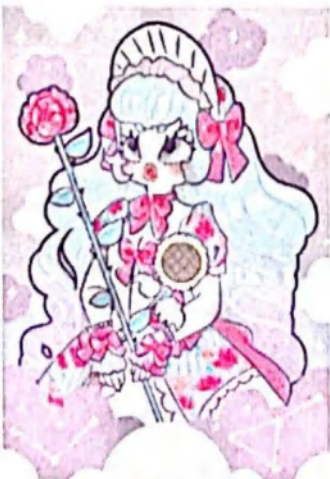
Queen of Wands

Reversed: When the Queen of Wands enters a reading in reverse, it is time to loosen your grip a little. Try not to do too many things at once or put unrealistic expectations on yourself. Being in control can help put your mind at ease, but if you frequently feel stressed or anxious, you need to ask