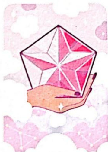
Ace of Pentacles

Reversed: Don't let self-doubt intimidate you or make you over-analyze your plans. Having financial and spiritual goals does not need to equate to heaps of pressure. Just because you are still figuring out your direction and experience setbacks along the way does not mean you're on the wrong track. Every successful person has gone through struggles to get to where they are. Take the pressure off yourself and have fun during the process of uncovering what truly works for you and what just wasn't meant to be.