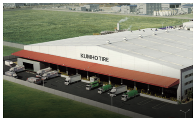
Pyeongtaek Plant: EV Lineup