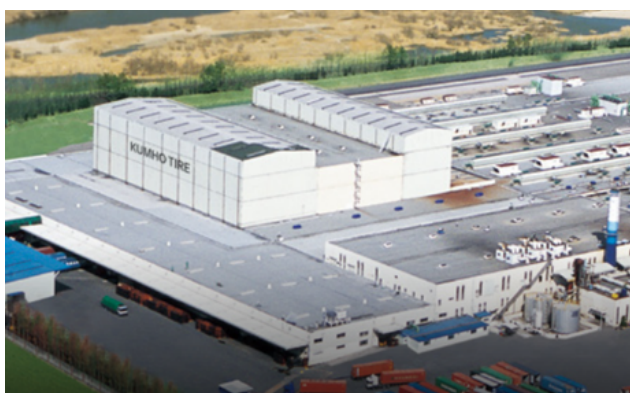
Gokseong Plant: TBR Tires