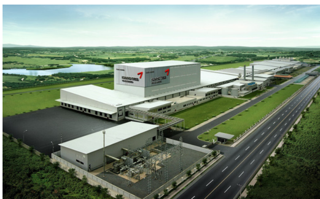
Vietnam Plant: PCR & MTAT

Authorized importer and distributor of Kumho Tires' 4 major asian factories , supplying the A/S market and major manufacturers.