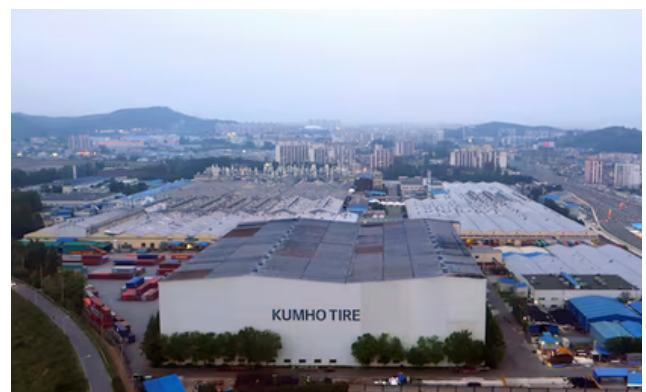
Gwangju Plant: OE Hyundai