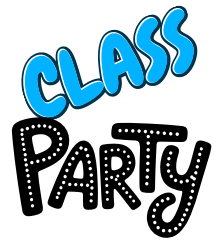
Voting for Favourite Food for Class Party