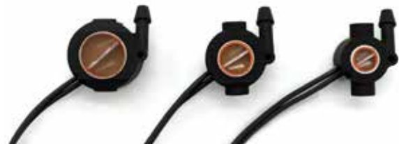
Three dual-crystal probes are included with the UTM Payload. Additional probe types are available for specialized applications.