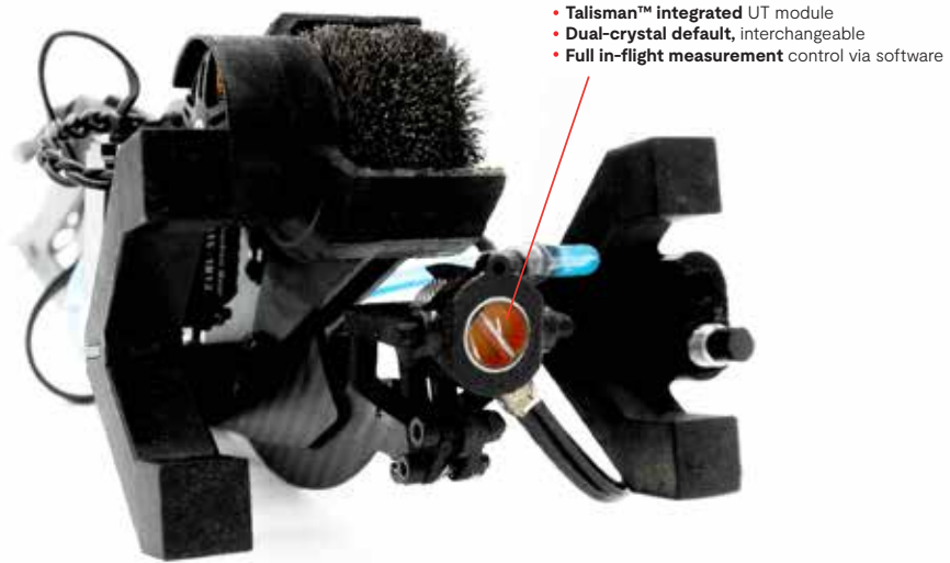
Thornetix dual-crystal probe – high precision and flexible frequency options.