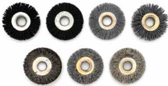
The UTM Payload comes with a selection of brushes for different purposes.