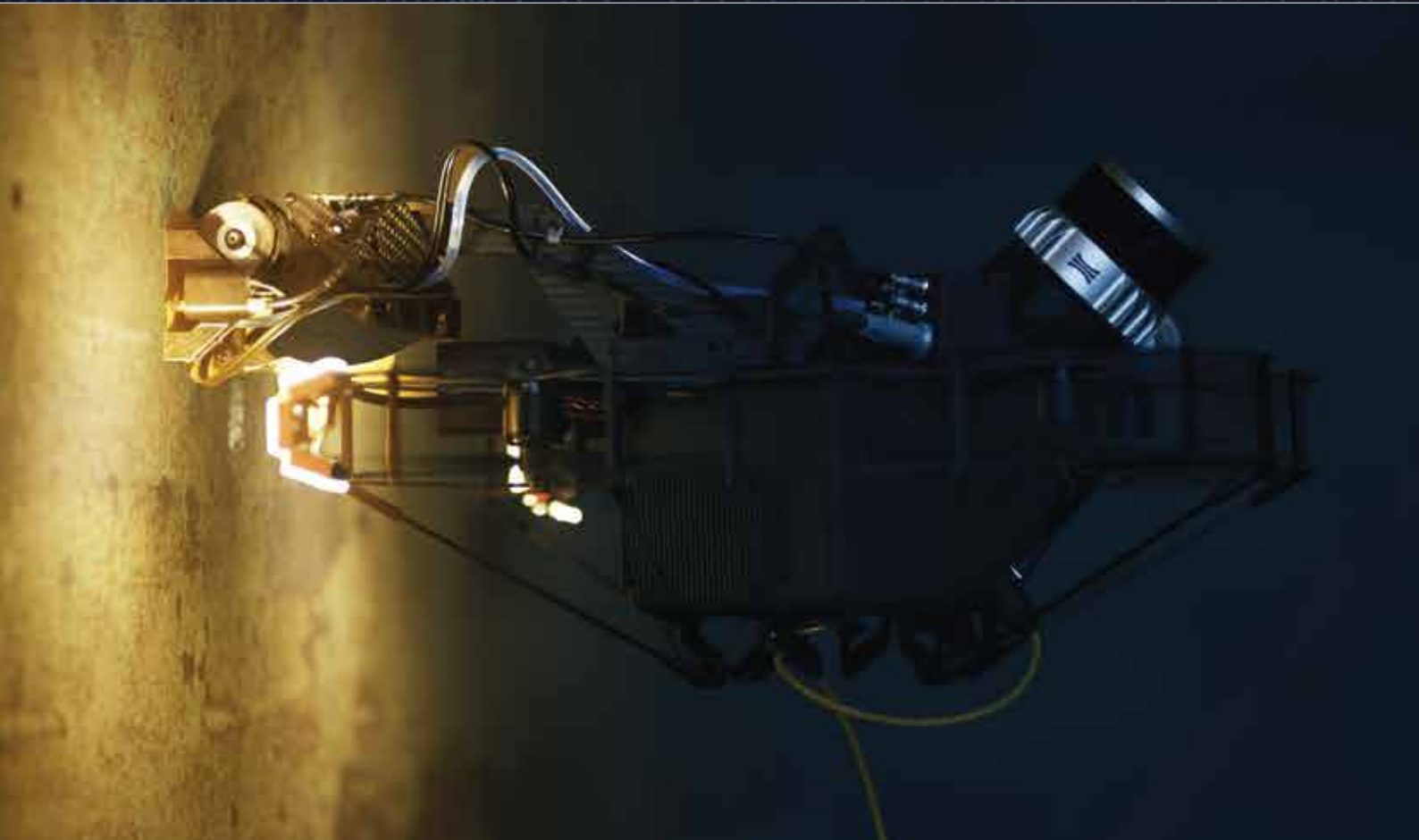
Next-Gen UTM Payload integrated on the Scout 137 Drone System - spot cleaning and UT Measurement in one operation.