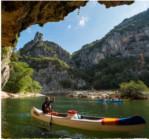
Explore dramatic gorges by foot or canoe

Nearby places to visit on Wednesdays or at the weekend