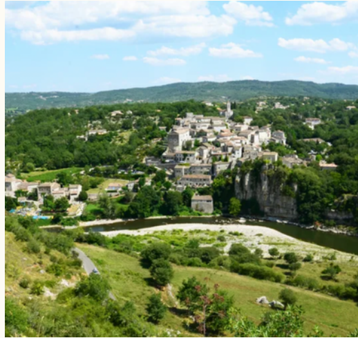
The Ardeche mountains has many hidden villages waiting to be discovered