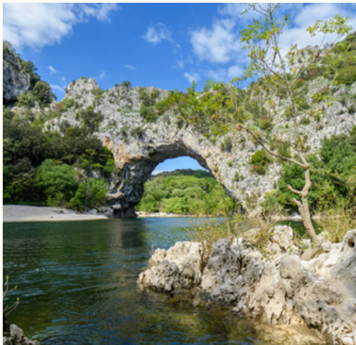
A day out in the stunning emblem of the Ardeche, Pont d' Arc