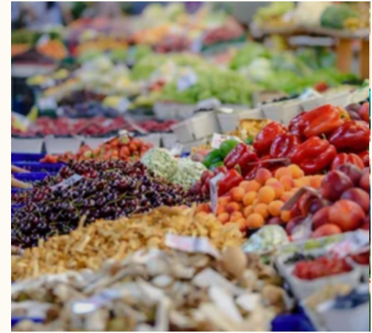
Love real food? Discover the local markets and festivals