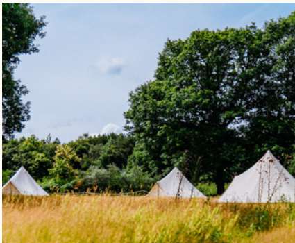
Bell Tent Camp Out - Optional

Inspired by our highly successful UK sleepaway camps for ages 8–16, this special summer program in July and August is exclusively offered to the teens of our guests. Mornings are spent in small groups under the guidance of experienced mentors, focusing on hands-on projects like gardening, natural cooking, or supporting the house café and shop. Teens learn leadership, entrepreneurship, and community engagement in an intimate, supportive environment.