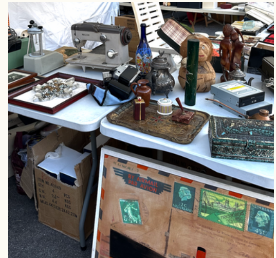
Spend sunday browsing brocantes full of vintage treasures