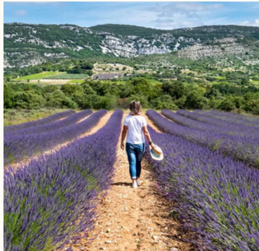
Explore the colours of the lavender fields