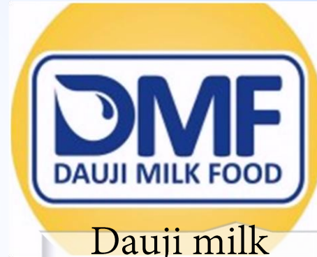
Dauji milk Foods