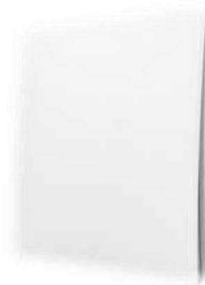
WIRELESS SWITCHES WITH IOT