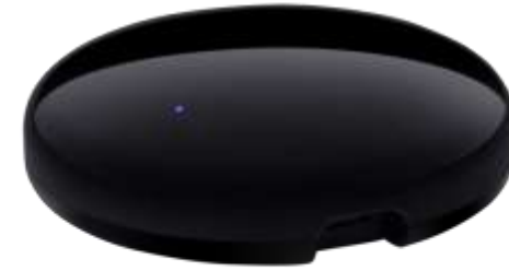
UNIVERSAL REMOTE CONTROLLER