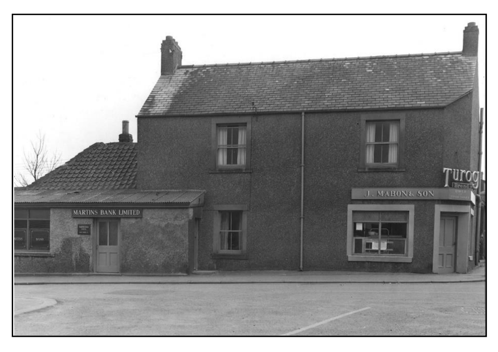
Martins Bank, 1959

The branch closed in 1942 due to the shortage of staff and reopened after the war on 7 May 1946.