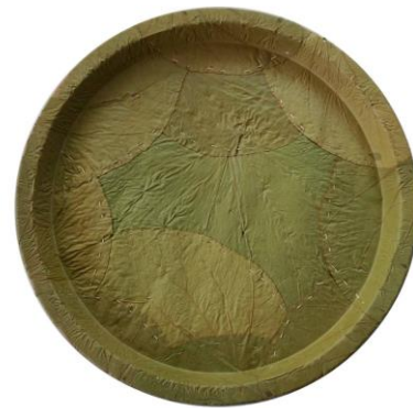
Handmade Leaf Paper Plate