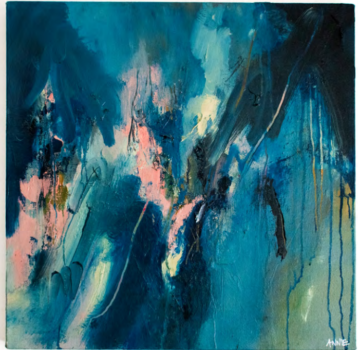
Into Nirvana 50 x 50cm, oil on canvas 2021