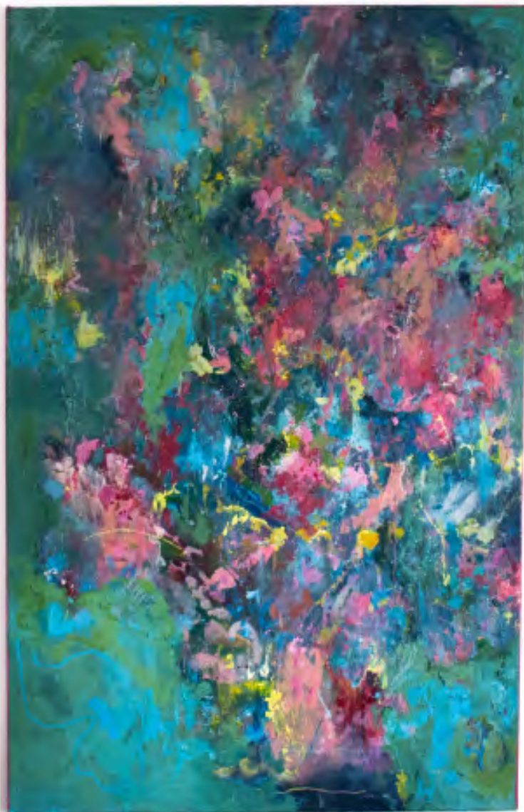
Could heaven ever be like this oil on canvas, 80 x 125cm 2023