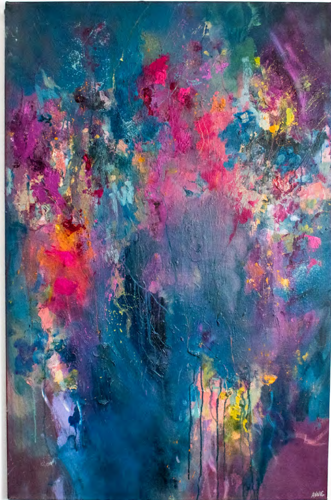
Shangri La oil on canvas, 80 x 125cm 2023