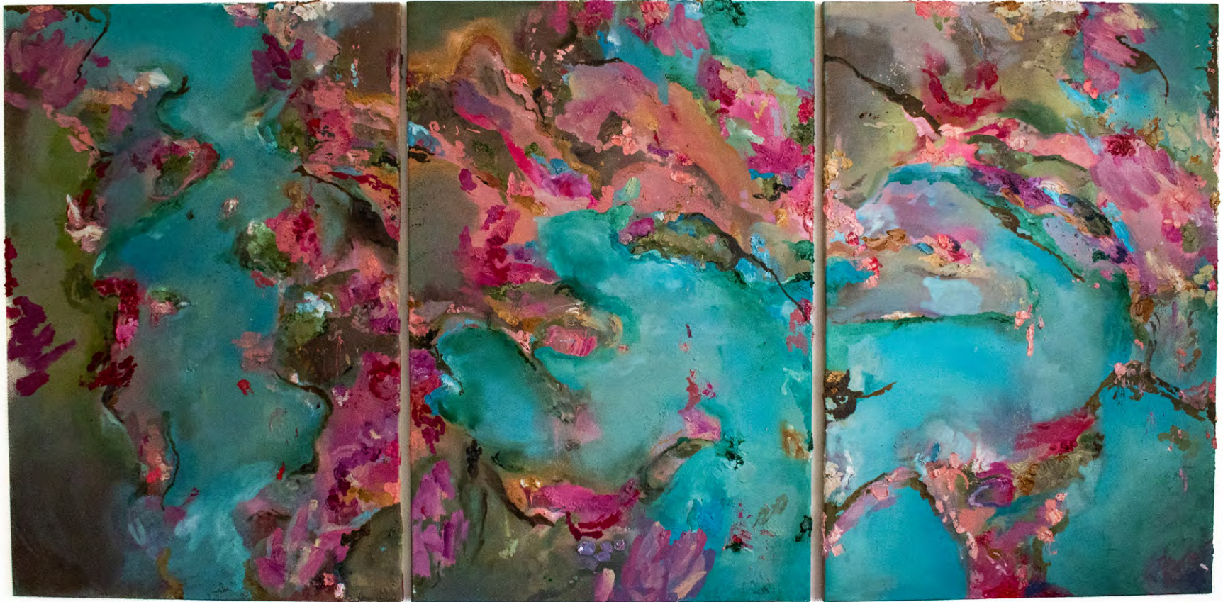
Surrenity and surrender oil on canvas, 72" x 32", each panel is 24" x 36", oil on canvas 2024