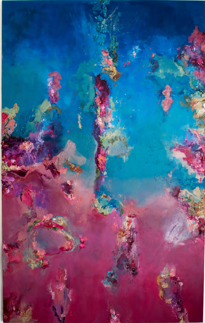
I met you in a dream oil on canvas, 100 x 140cm 2024