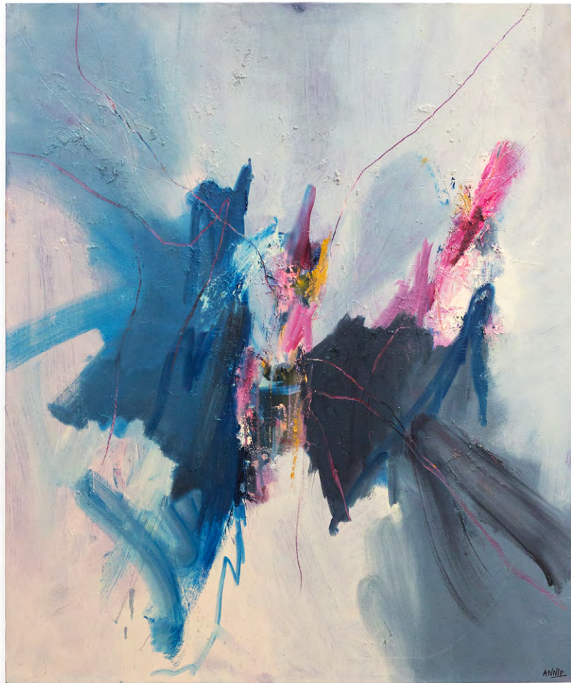
Slow Mover 100cm x 120cm, Oil on canvas 2020