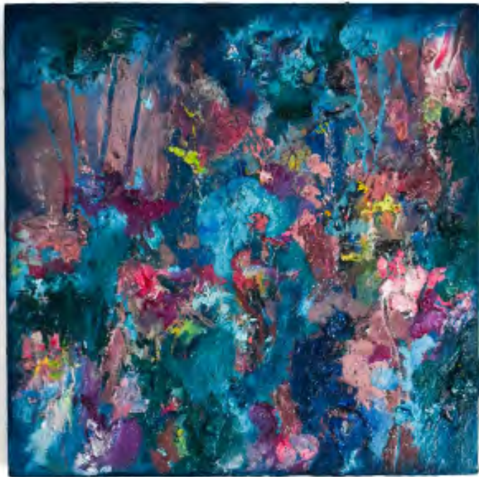
Smile in the face of the devil 50 x 50cm, oil on canvas 2023