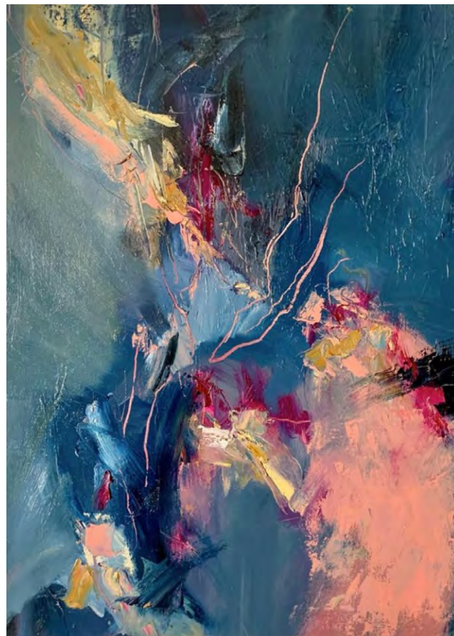
Withdraw 60 x 80cm, Oil on canvas 2021