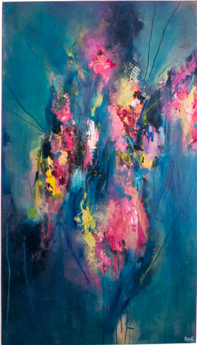
Last man on earth oil on canvas, 80 x 140cm 2023