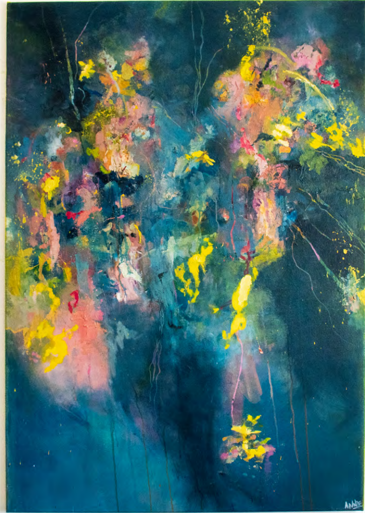
Nirvanas bestfriend oil on canvas, 80 x 125cm 2023