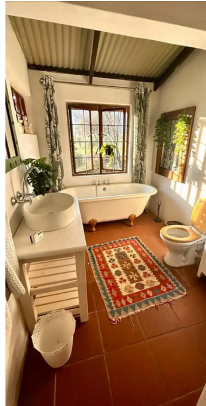
Ancient Earth Homestead

We offer shuttle services to our guests upon request. If you require this service, please do not hesitate to enquire with your function manager.