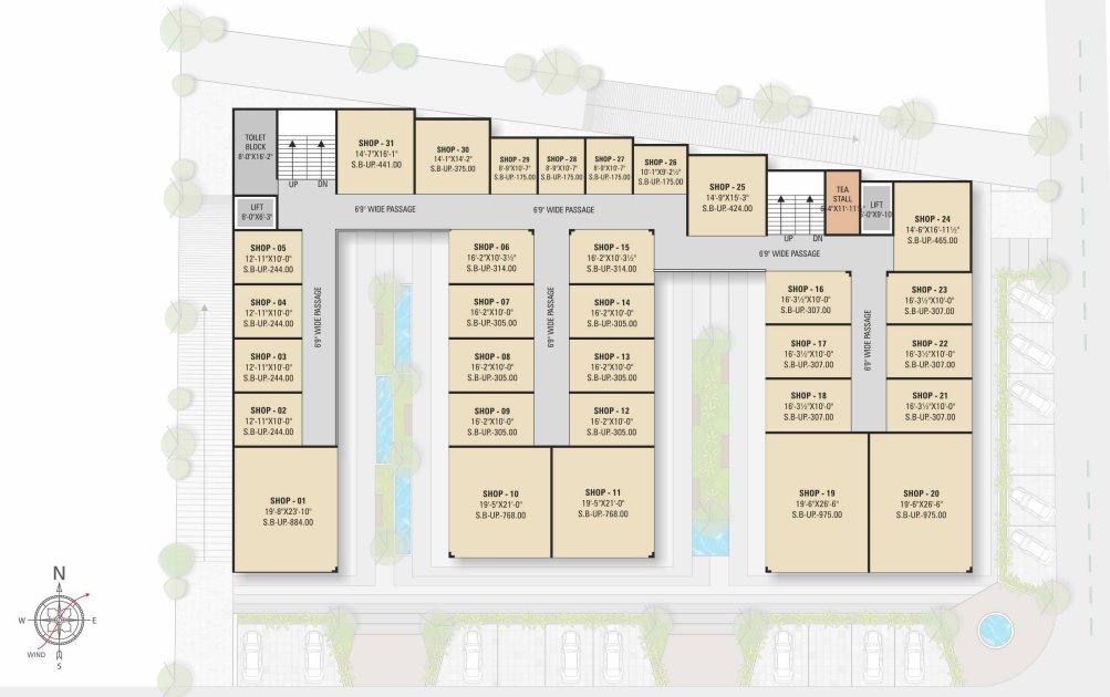
SECOND & THIRD FLOOR PLAN