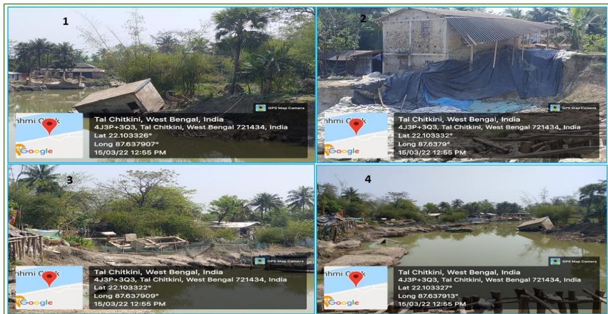
Photo Plate 1: Houses Damage at Patashpur-I CD Block in Flood, 2021