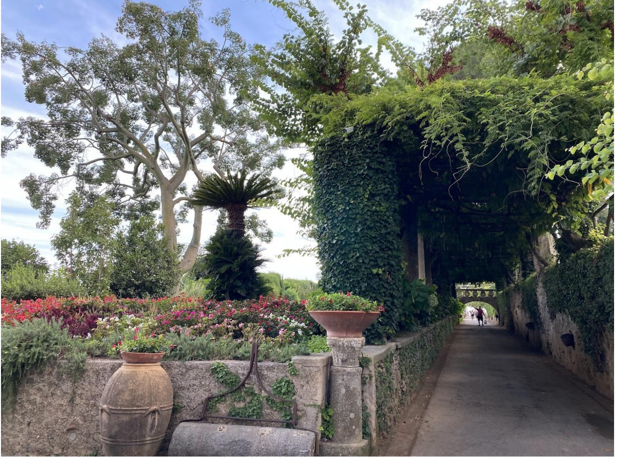
The Avenue of Immensity leads to the Infinity Terrace. Side paths reveal more garden gems.