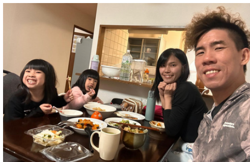
First dinner at new home