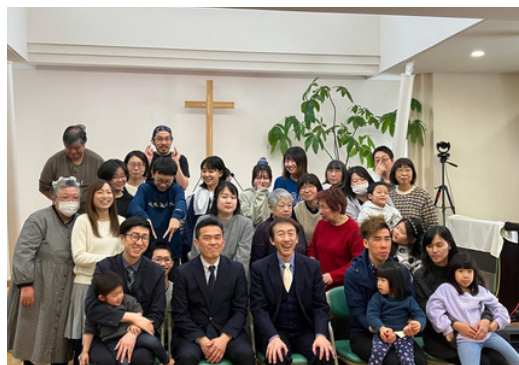
Church that we attend Bunkyo dai Rainbow Church

Rejoice always, pray continually, give thanks in all circumstances; for this is God's will for you in Christ Jesus.