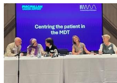
I was invited to join the Macmillan MDT conference panel as a patient representative.

In May, art therapy using fibres: "Life Is Full of Choices." Some aspects of life — such as race, gender, family name, or height — cannot be chosen (Lt). But we can choose how to live, what materials to use, and what colours to add to life (Rt).