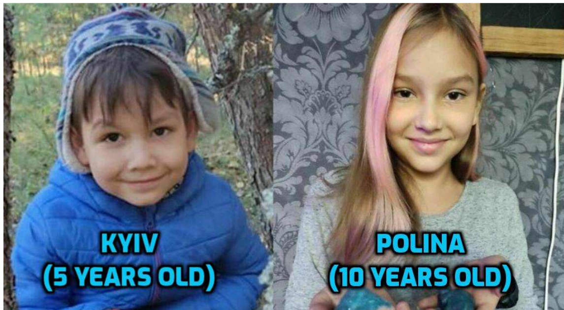
KYIV (5 YEARS OLD)