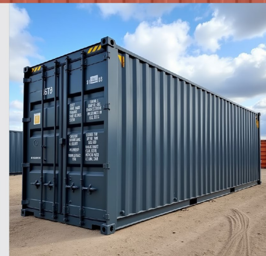
Brand New 40ft