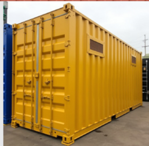
Brand New 20ft

We proudly offer state-of-the-art solar-powered containers—a sustainable, mobile, and efficient energy solution tailored for diverse needs across the UAE. Designed to operate independently off the grid, our solar containers are ideal for remote sites, construction zones, temporary offices, emergency response stations, and more. Each unit is equipped with high-efficiency solar panels, durable battery storage, and weather-resistant engineering to ensure continuous power supply even in the harshest environments. As part of our commitment to innovation and sustainability, Maxzain's solar containers provide an eco-friendly alternative to traditional power sources, helping businesses reduce their carbon footprint while maintaining reliable energy access anywhere in the Emirates.