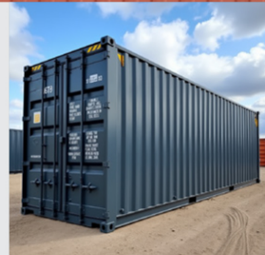
Brand New 40ft