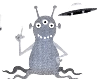
a science fiction film