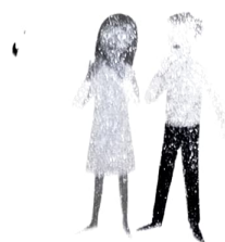
a horror film