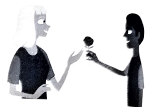
a romantic comedy