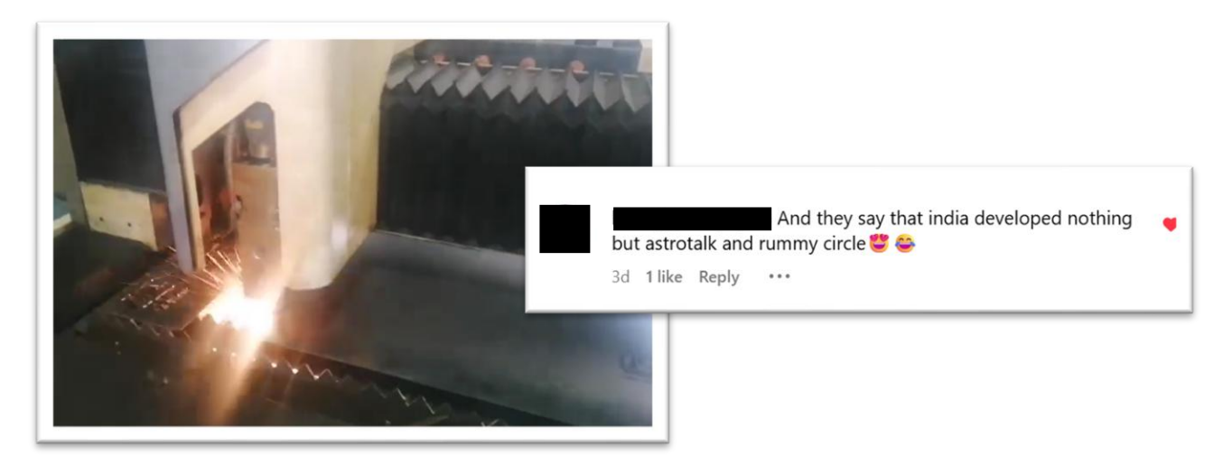
A still from the shopfloor and from our fanbase - Redefining Climate-Positive Living, One Kitchen at a Time