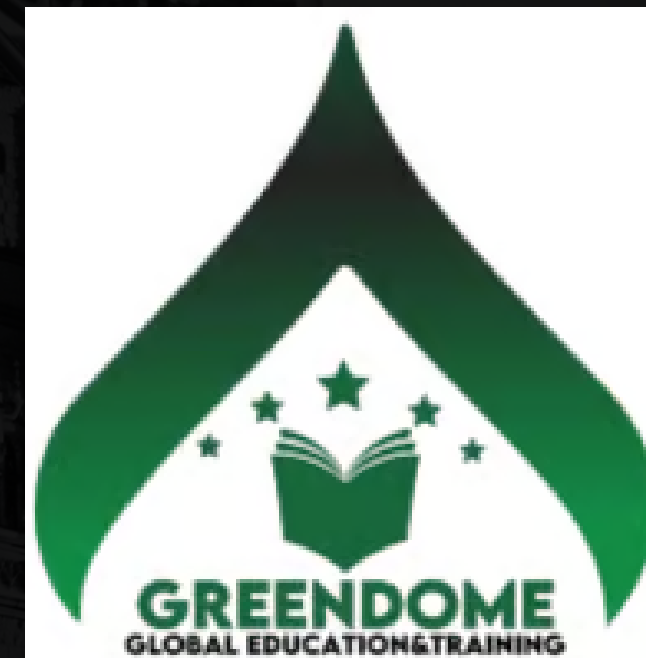
Greendome Global Education, London