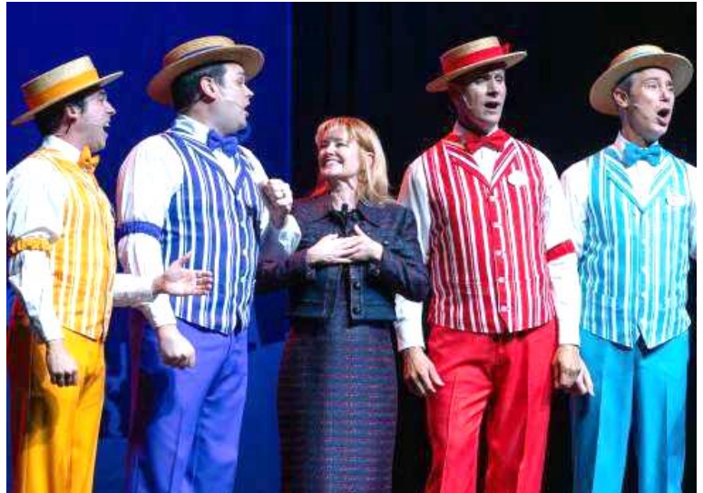
Anaheim Mayor Ashleigh Aitken is escorted on stage by the Dapper Dans barbershop quartet where she gives her State of the City address on Tuesday, April 29, 2025 in Anaheim.

Aitken, drawing on the city's immigrant roots, said Anaheim is a place that has welcomed the world in, whether as a new home or an escape for a day at Disneyland.