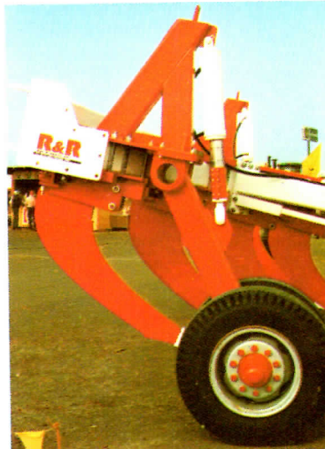
Trip Shank option eliminates shear bolt replacement and expensive down time. Simply back up to reset.