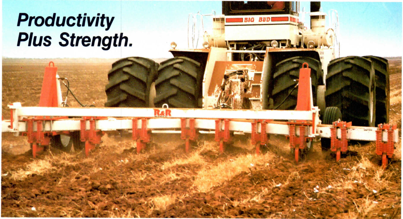
R 26H-EHD with 11 resettable trip shanks.

The Patented R&R Extra Heavy Duty Subsoiler! When you want higher crop potential in the toughest terrain, get the machine that's engineered to take the punishment.