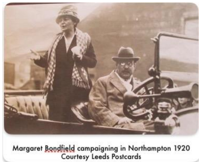
Margaret Bondfield campaigning in Northampton 1920