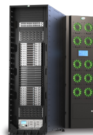
Rear Door Heat Exchanger