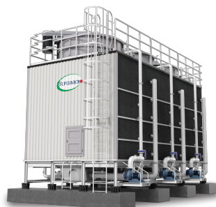
Water Cooling Tower