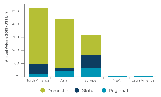
Exhibit 2 Targets of Global Capital – 2015

Source: Atlas Outlook 2016. Cushman & Wakefield Capital Markets Research Publication