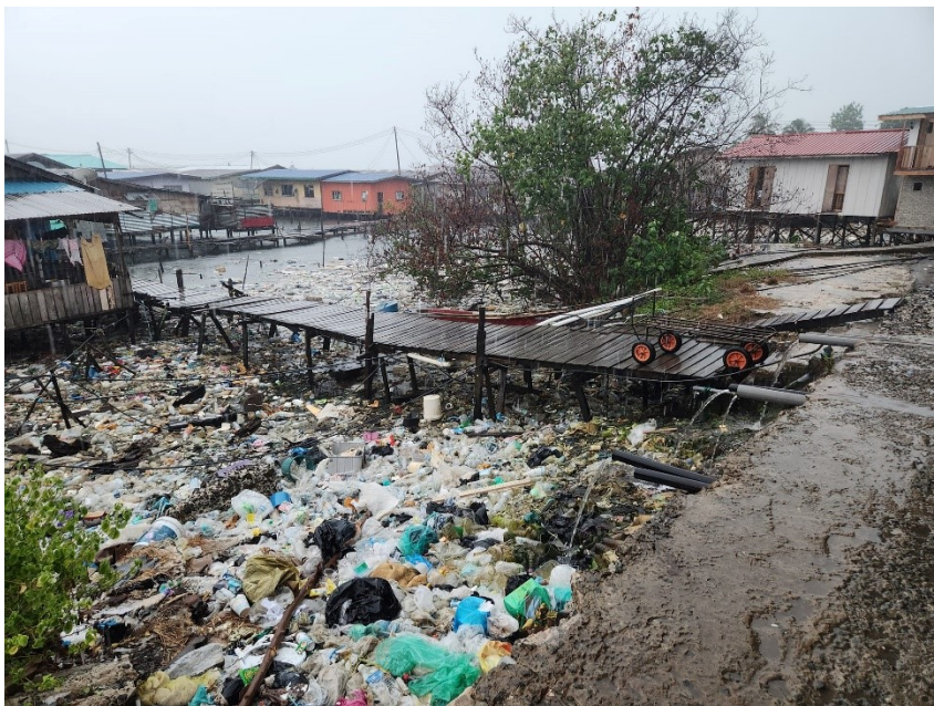
Discharge of wastewater from the marine collection centre, including unmanaged waste within the marine ecosystem will pollute the quality of the marine landscape in the long term.

Several actions need to be carried out seriously and systematically by the respective enforcement and government agencies. This includes the safety and health issue, waste-water treatment issue, water quality monitoring issue, systematic waste management issue, community awareness programme and development of Blue Community program to fulfil the Blue Certification and SDGs