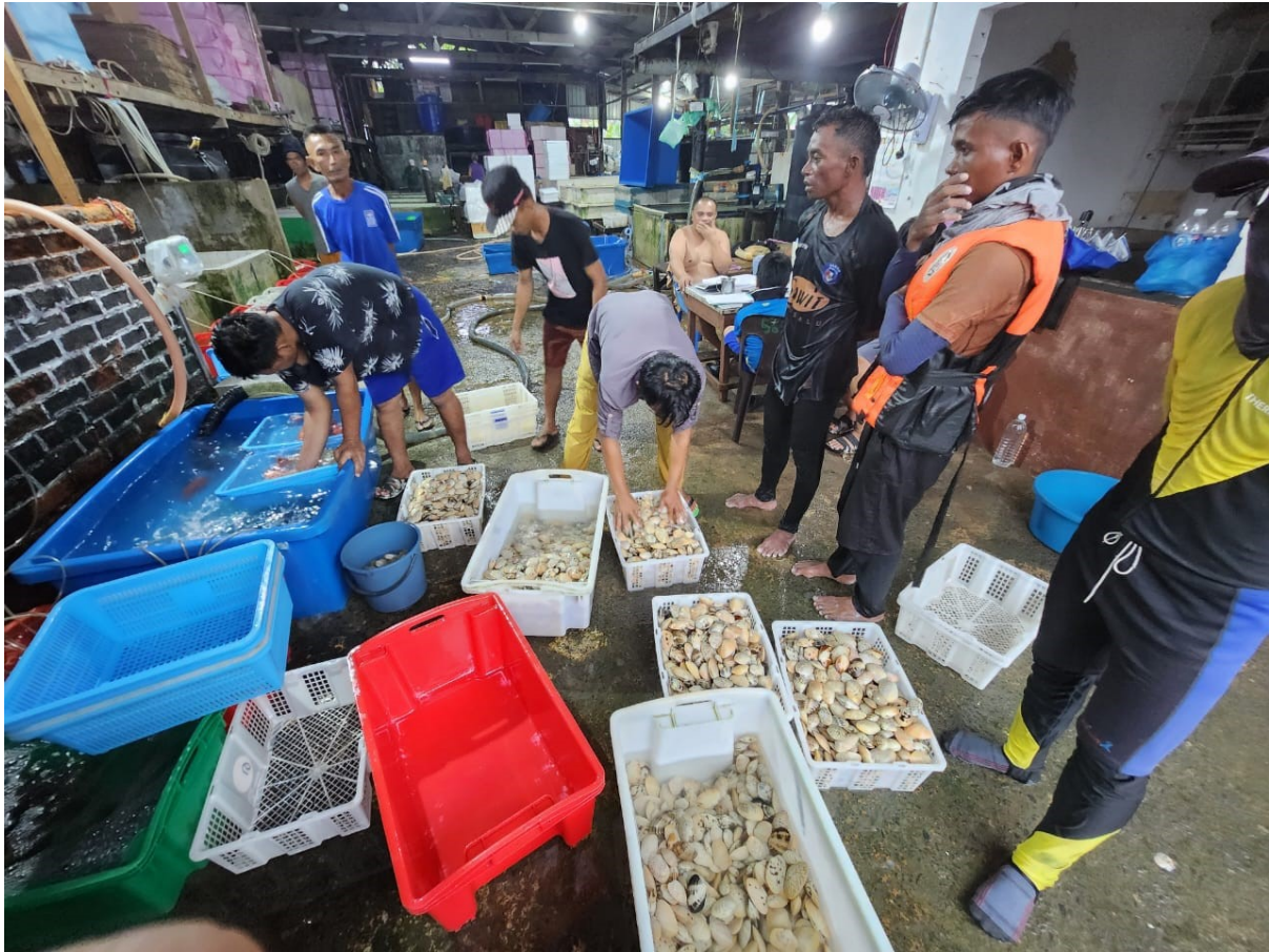
This photo shows grading work by the Marine Collection Centre