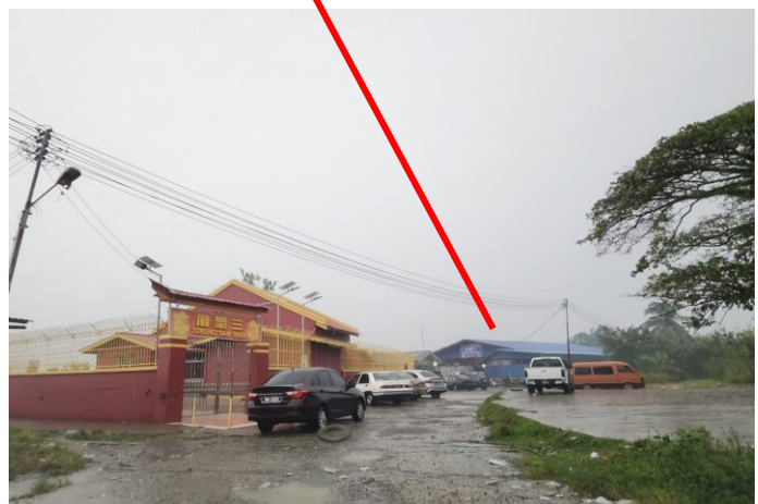
One of the Marine Collection Centre