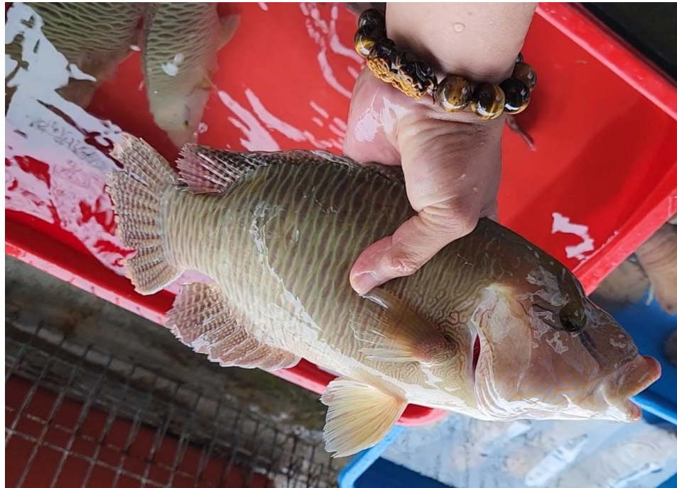
Photo of the humphead wrasse ( Cheilinus undulatus ) @ Mameng, found in the open market.

The humphead wrasse is listed as endangered on the IUCN Red list and in Appendix II of CITES. Its numbers have declined due to multiple threats, including: Intensive, species-specific removal by the live reef food-fish trade throughout its core range in Southeast Asia, Destructive fishing techniques, including bombs and cyanide, Habitat loss and degradation, Local consumption, and its perception as a delicacy to locals and tourists, existence of export market for juveniles for the marine aquarium trade, Lack of coordinated consistent national and regional management, Inadequate knowledge of the species and Illegal, unreported, and unregulated fishing (IUU Fishing)