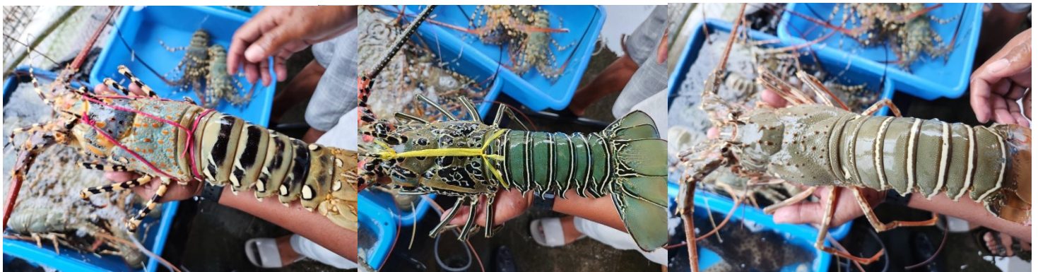
Three species of Lobster that is available in the Open market in Semporna