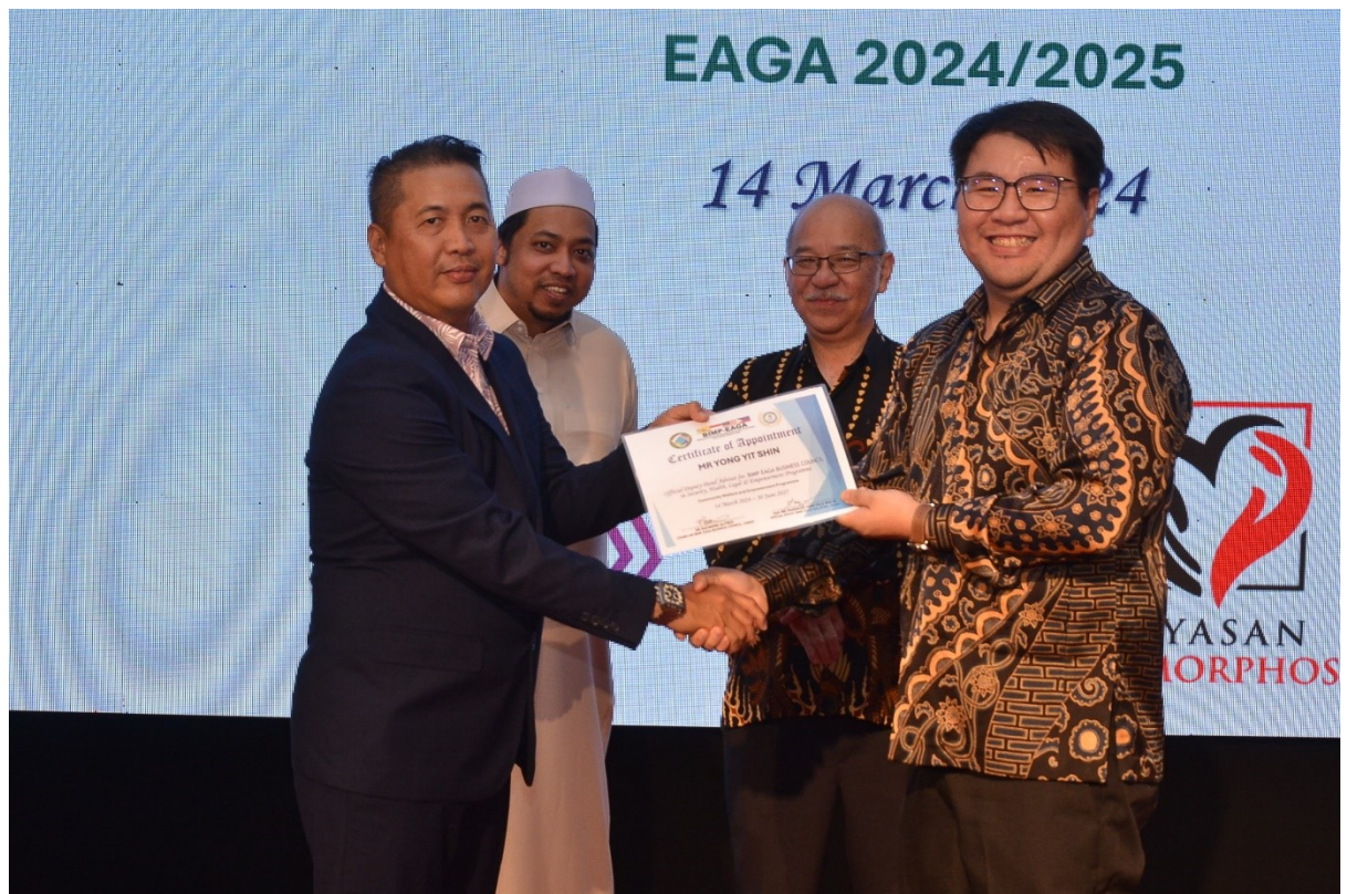
Mr Yong Yit Shin