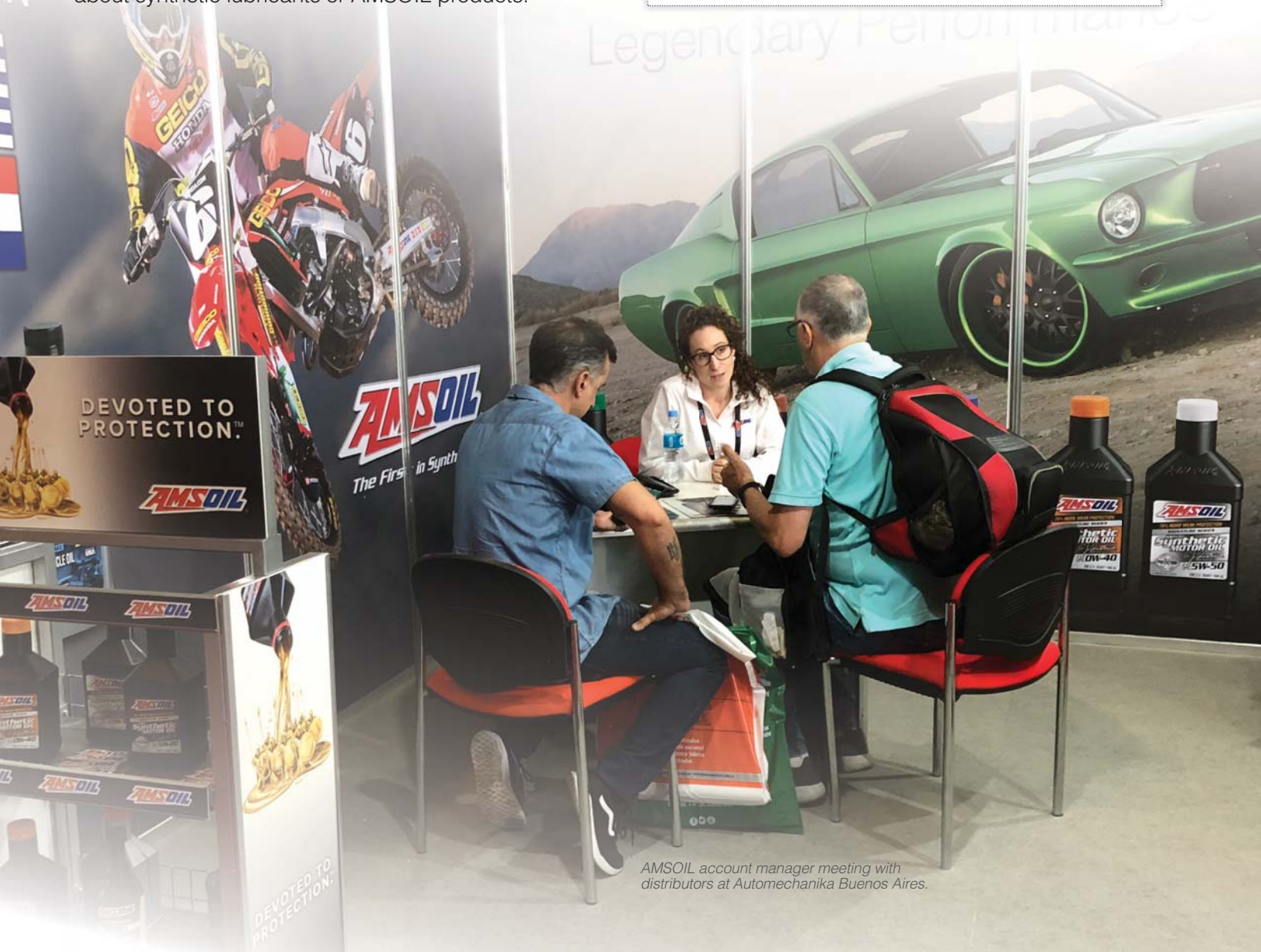
AMSOIL account manager meeting with distributors at Automechanika Buenos Aires.