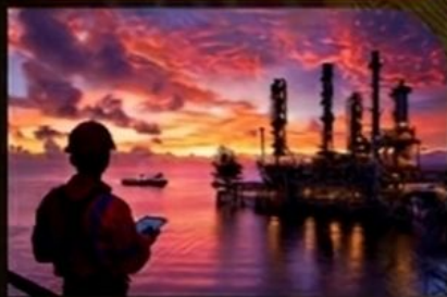
PETROLEUM REVOLUTION 1980