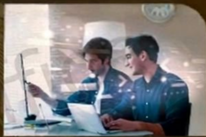
IT REVOLUTION 2000