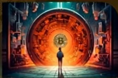
FOREX REVOLUTION 2026