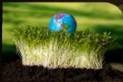
GREEN REVOLUTION 1960