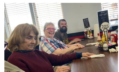
March 25 -The Bible Study Group from our church and the Methodist Church out to lunch then off to see the movie "The Last Supper"

Palm Sunday commemorates the entrance of Christ into Jerusalem, during which palm branches were placed in his path, before his arrest on Holy Thursday and his crucifixion on Good Friday. It thus marks the beginning of Holy Week, the final week of