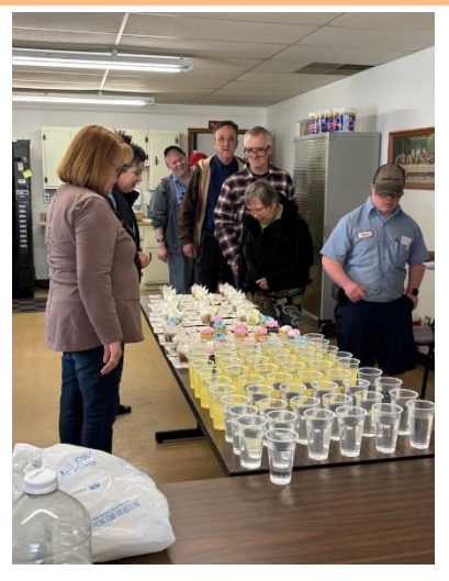
March Birthday Celebration with 56 people at Quality Industries