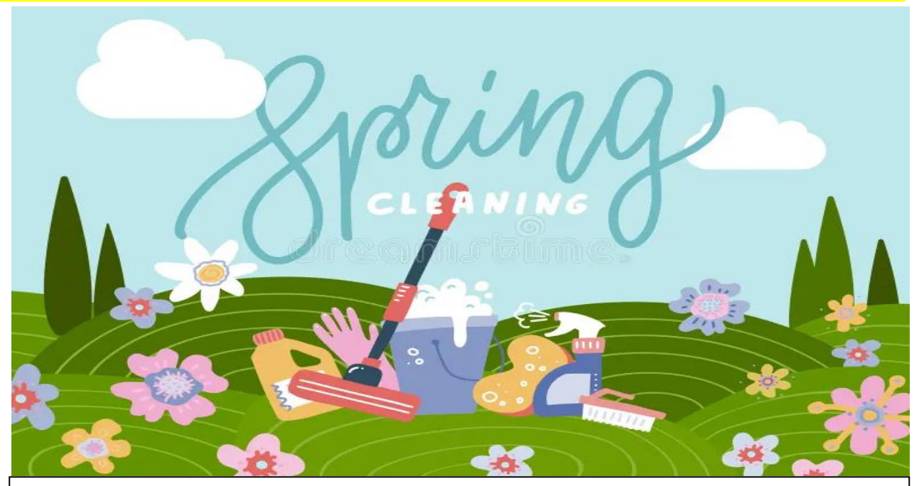
April 19<sup>th</sup> – 10:00 a.m. - 1:00 p.m.

Join in the fun with cleaning up our church grounds, do some general maintenance and let's plant flowers!