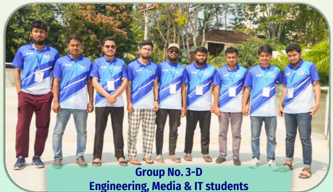
Group No. 3-D Engineering, Media & IT students