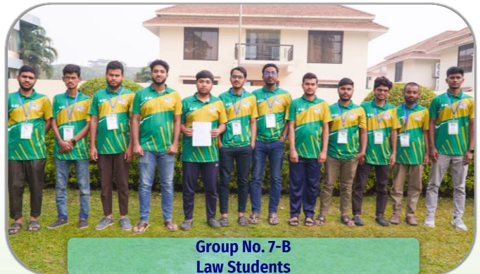
Group No. 7-B Law Students