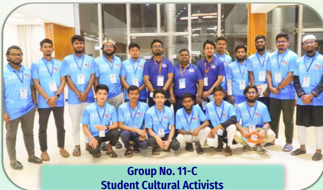
Group No. 11-C Student Cultural Activists