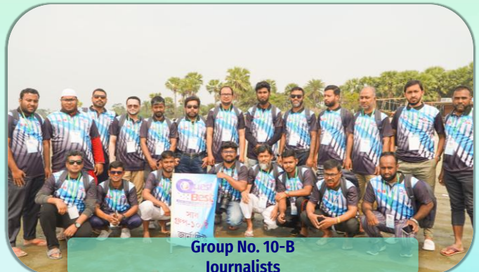
Group No. 10-B Journalists