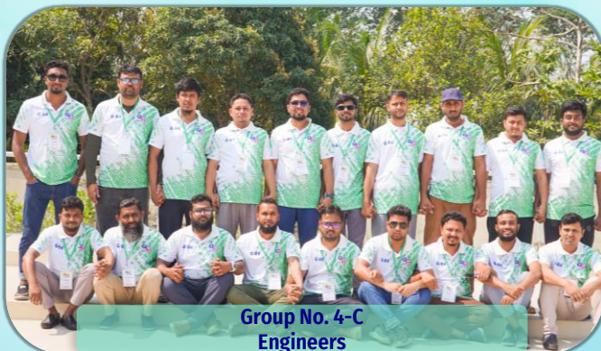
Group No. 4-C Engineers