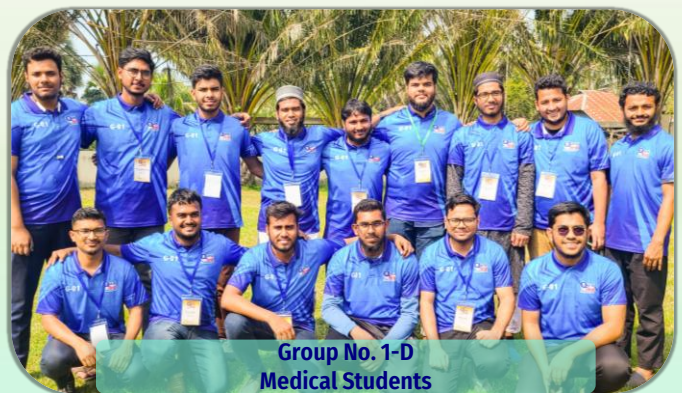
Group No. 1-D Medical Students