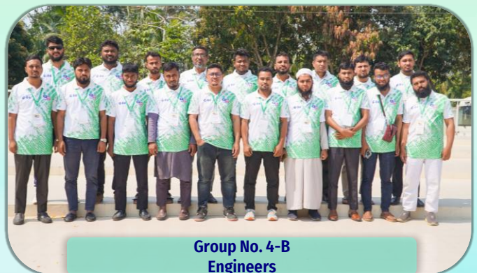
Group No. 4-B Engineers