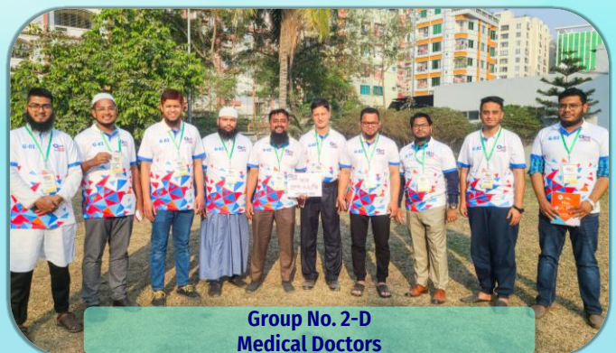
Group No. 2-D Medical Doctors