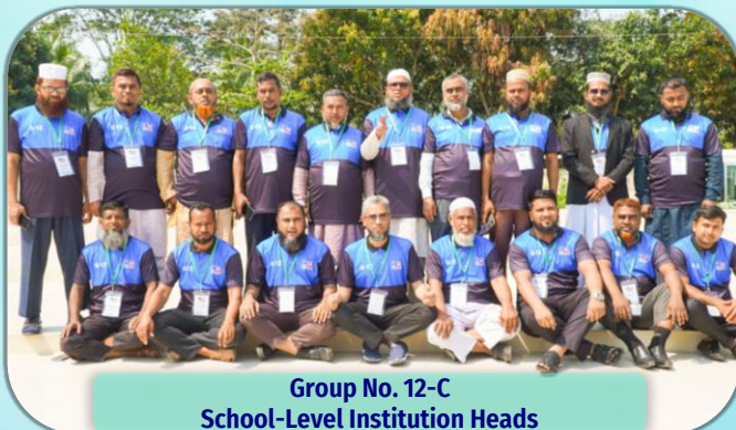
Group No. 12-C School-Level Institution Heads