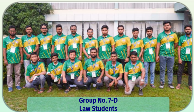
Group No. 7-D Law Students