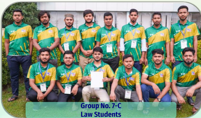
Group No. 7-C Law Students