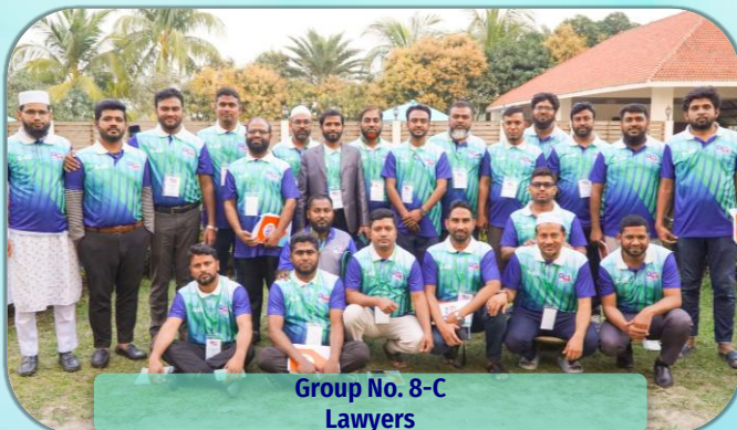
Group No. 8-C Lawyers