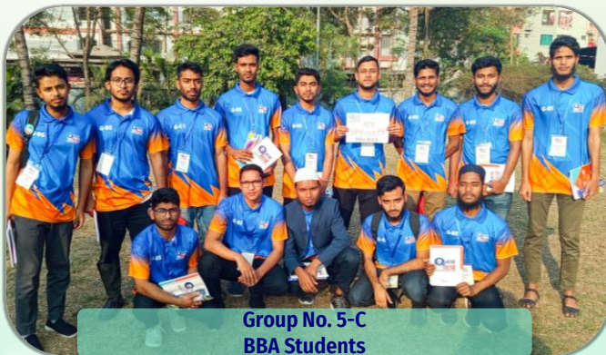
Group No. 5-C BBA Students