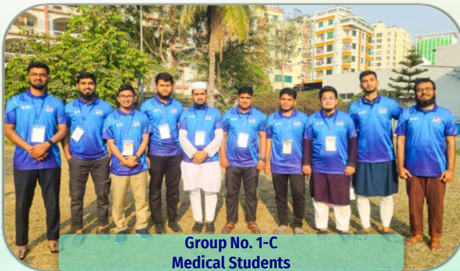
Group No. 1-C Medical Students