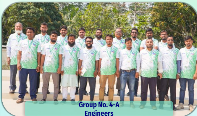
Group No. 4-A Engineers