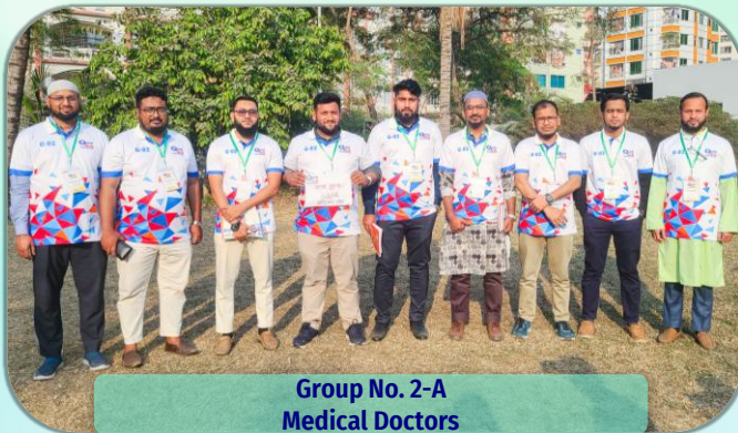
Group No. 2-A Medical Doctors