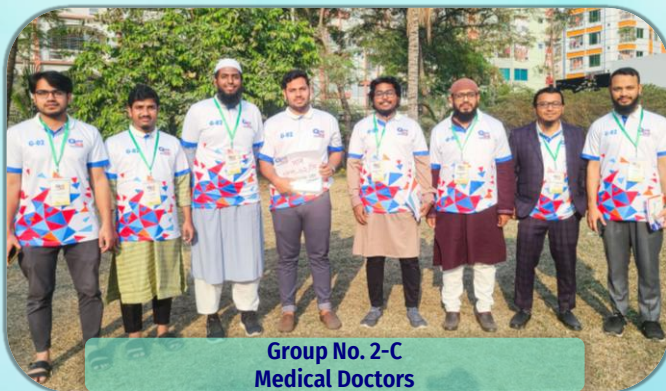
Group No. 2-C Medical Doctors