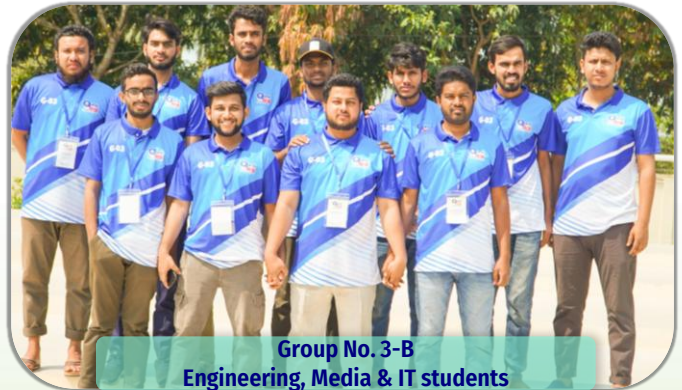
Group No. 3-B Engineering, Media & IT students