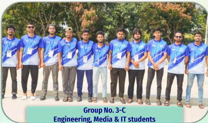
Group No. 3-C Engineering, Media & IT students