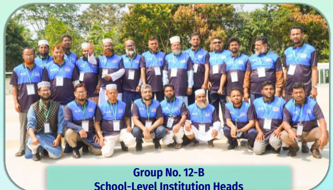
Group No. 12-B School-Level Institution Heads