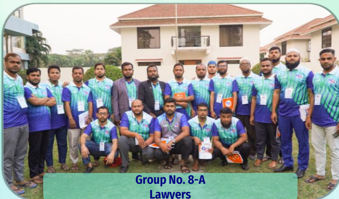
Group No. 8-A Lawyers