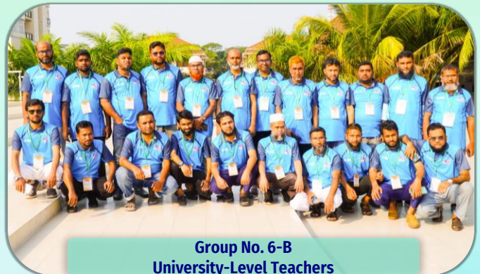
Group No. 6-B University-Level Teachers