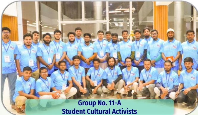
Group No. 11-A Student Cultural Activists