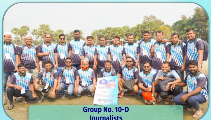
Group No. 10-D Journalists