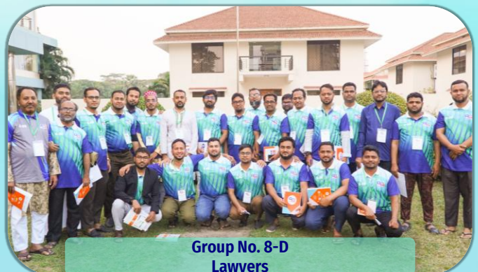
Group No. 8-D Lawyers