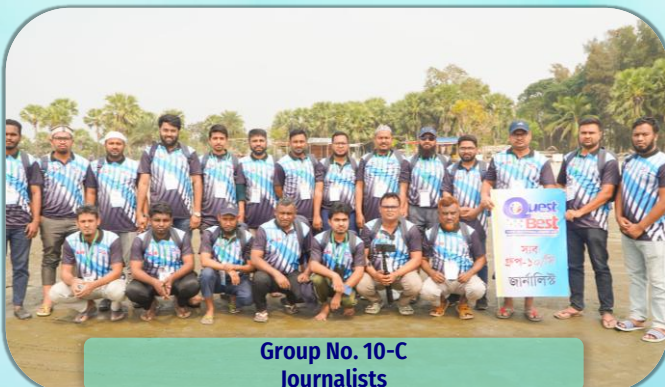
Group No. 10-C Journalists