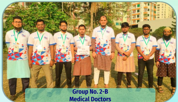
Group No. 2-B Medical Doctors