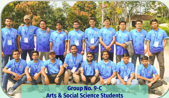
Group No. 9-C Arts & Social Science Students