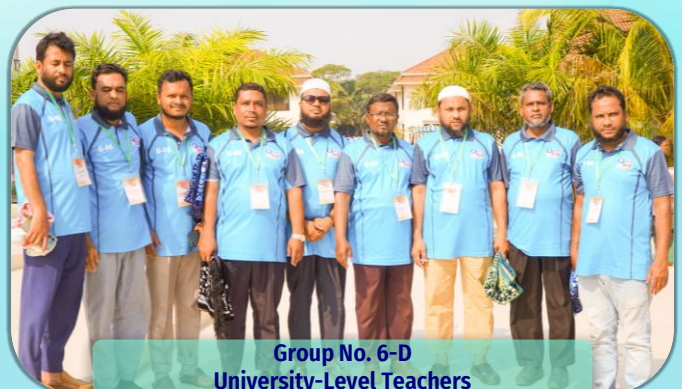
Group No. 6-D University-Level Teachers