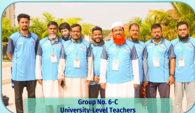
Group No. 6-C University-Level Teachers