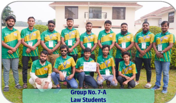
Group No. 7-A Law Students