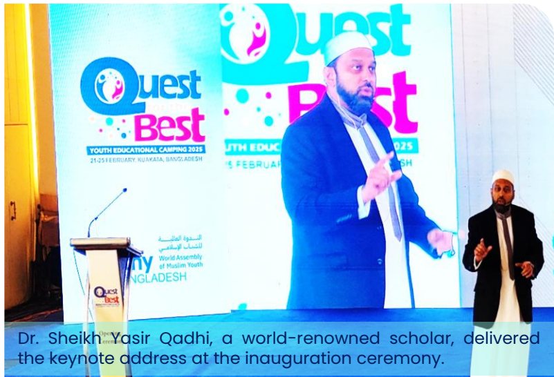
Dr. Sheikh Yasir Qadhi, a world-renowned scholar, delivered the keynote address at the inauguration ceremony.