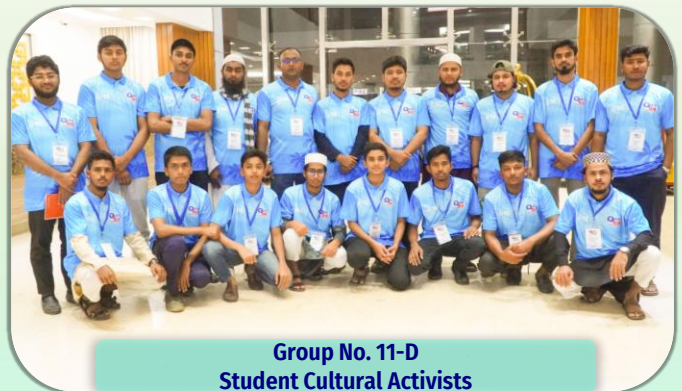
Group No. 11-D Student Cultural Activists