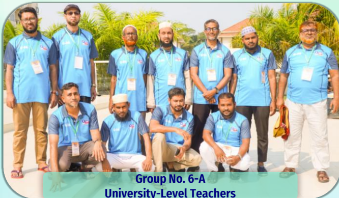
Group No. 6-A University-Level Teachers