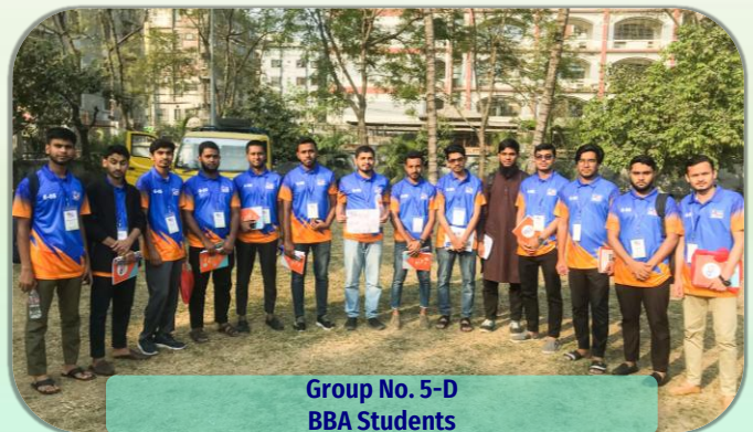
Group No. 5-D BBA Students