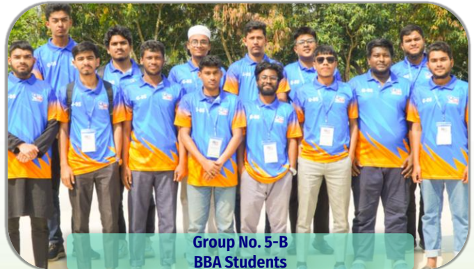
Group No. 5-B BBA Students