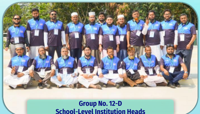
Group No. 12-D School-Level Institution Heads