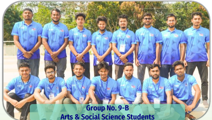
Group No. 9-B Arts & Social Science Students