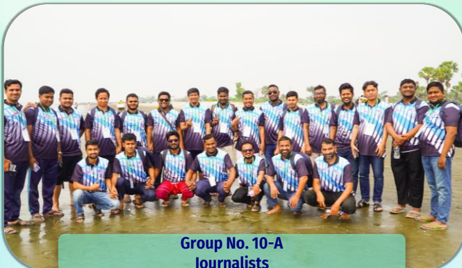
Group No. 10-A Journalists