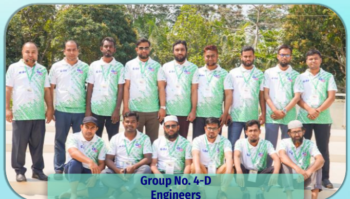
Group No. 4-D Engineers