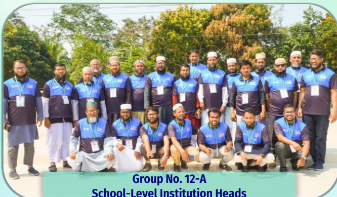
Group No. 12-A School-Level Institution Heads