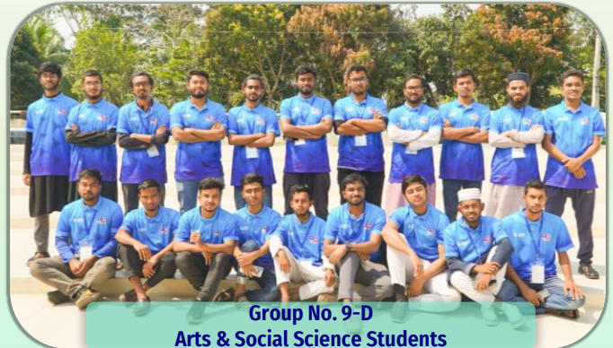
Group No. 9-D Arts & Social Science Students