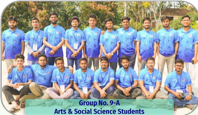
Group No. 9-A Arts & Social Science Students