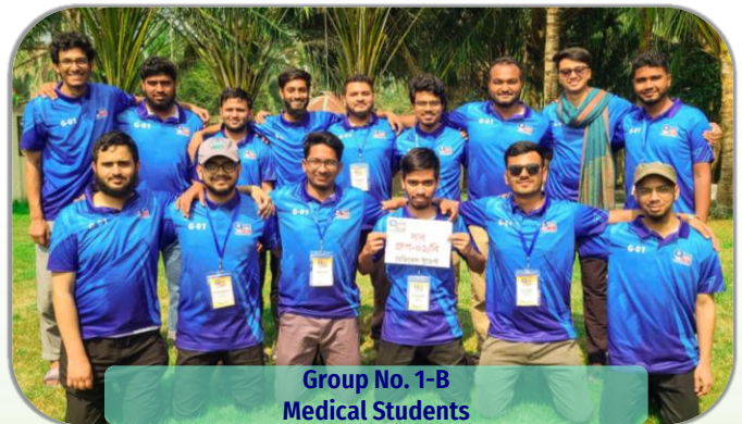
Group No. 1-B Medical Students