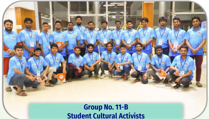
Group No. 11-B Student Cultural Activists