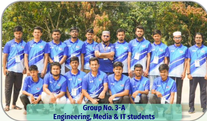
Group No. 3-A Engineering, Media & IT students