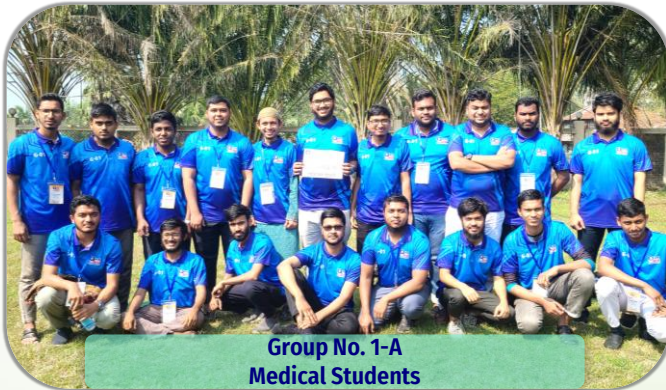
Group No. 1-A Medical Students