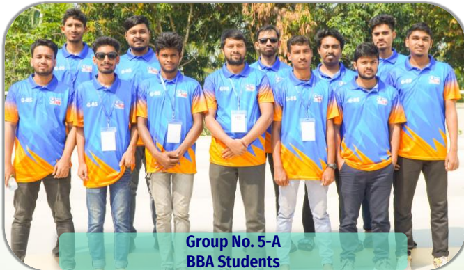
Group No. 5-A BBA Students