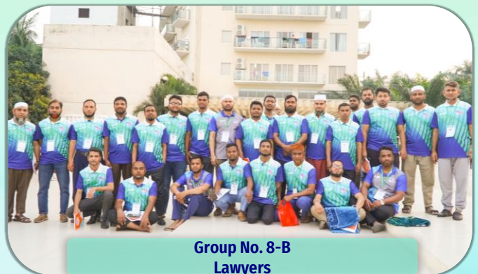
Group No. 8-B Lawyers