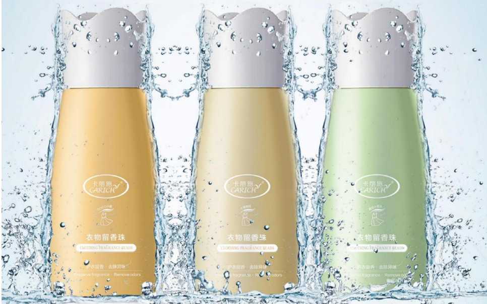
Clothing fragrance beads Miss coco/ten mile south wind/encountering little azure orchid

FRAGRANT AND SOFT PURIFYING CARE RADIANT FRAGRANCE AND SMOOTH TEXTURE CARING FOR FABRICS FRESH AND FRAGRANT