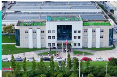
Clean Breath Biotechnology Industrial Park (Binhai, Jiangsu)

The production building area of the Greenleaf Headquarters Intelligent Manufacturing Center is 60000 square meters, and the entire workshop is a 100000 level clean workshop that has passed ISO9001, ISO22716 certification and international GMP certification. 12 automated production lines for beauty, skincare, and laundry products, producing over 80000 tons of cosmetics and daily necessities annually. The production line adopts advanced production equipment and quality control systems such as German EKATO, French KALIX, and Swiss ABB robots.