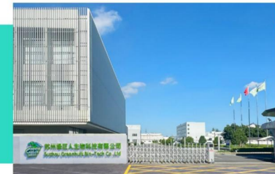
Greenhulk Bio-Tech Industrial Park (Suzhou Wujiang)

Suzhou Greenhulk Bio-Tech Co., Ltd. formerly known as Beijing Greenleaf Century Daily Chemical Products Co., Ltd., established a factory in Wujiang Economic Development Zone, Suzhou in 2017 with a registered capital of 150 million yuan, a total construction area of 26682 square meters, a land area of 56.2 acres, a production workshop area of 11000 square meters, and 16 automated production lines. It is mainly engaged in the R&D, production and sales of disinfection and sterilization medicine and equipment, household cleaning, pest control and other products, with an annual output of 60000 tons of household cleaning products.