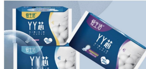
Paper hygiene products