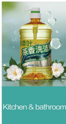
Kitchen & bathroom