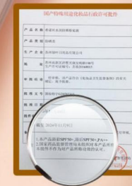
National makeup certificate

Concealer and sunscreen Sunscreen isolation SPF50+ PA++isolates ultraviolet radiation Moisturizing and softening the skin Multiple moisturizing essence