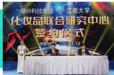
Jiangnan University Cosmetics Joint Research Center (Wuxi, Jiangsu)

Up to now, a total of 11 national invention patent authorizations have been obtained; Published 54 scientific research papers; Published 5 team efficacy standards, participated in the development of 10 national standards, and 1 industry standard. Obtained honors such as Jiangsu Province Enterprise Standard Leader and Jiangsu Boutique, and also passed the certification of Jiangsu Province Enterprise Technology Center. Previously, it has been certified by Suzhou Enterprise Technology Center and Suzhou Engineering Technology Center. Accumulatively developed over 1000 new products and launched over 700 models.