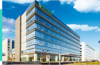
Suzhou Headquarters Industrial Park (Suzhou High Tech Zone)

The production building area of the Greenleaf Headquarters Intelligent Manufacturing Center is 60000 square meters, and the entire workshop is a 100000 level clean workshop that has passed ISO9001, ISO22716 certification and international GMP certification. 12 automated production lines for beauty, skincare, and laundry products, producing over 80000 tons of cosmetics and daily necessities annually. The production line adopts advanced production equipment and quality control systems such as German EKATO, French KALIX, and Swiss ABB robots.