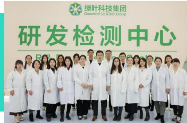
Greenleaf Headquarters R&D Center (Suzhou High tech Zone)