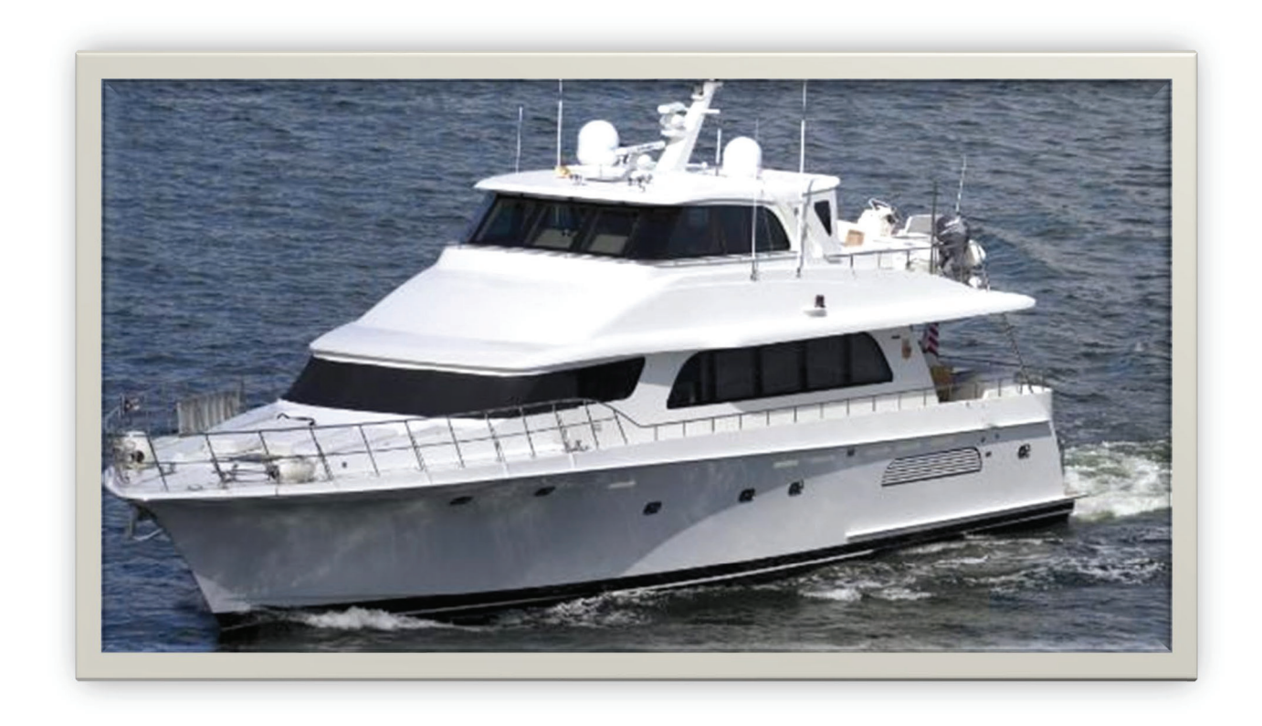
84' Cheoy Lee was launched in 1990. fantastic condition and currently used as a very successful Wedding Charter Vessel. Turnkey Charter business available for additional cost.