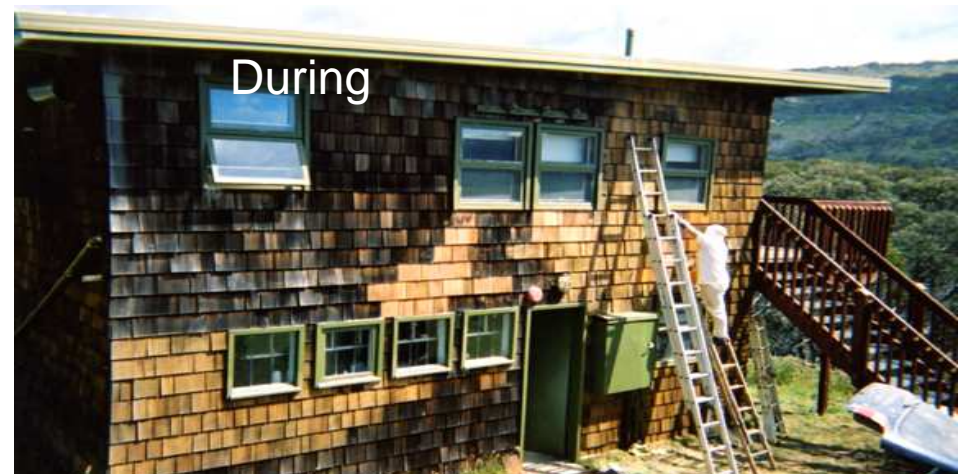
Feb 12, 2002: Replacing shingles: Note – new deck; stairs to north – built after 1992.