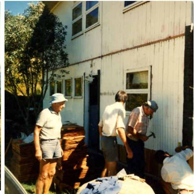
Summer 1980: First shingles