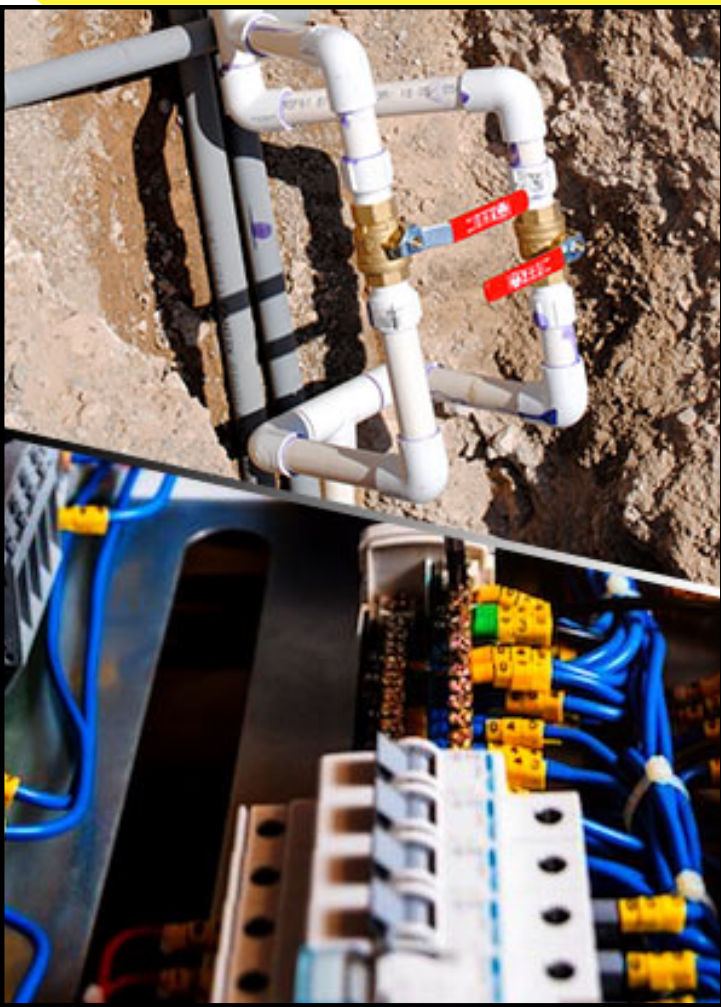
✓ Electrical & Plumbing