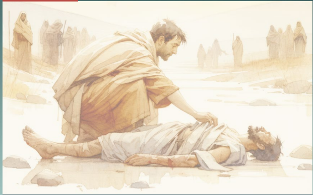
The Parable of the Good Samaritan [Luke 10:25-37]