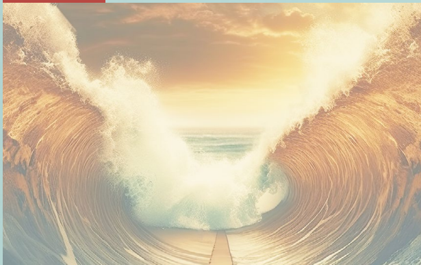
The Exodus: Crossing the Red Sea [Exodus 14:5-31]