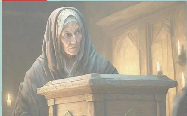
The Widow's Offering [Mark 12:41-44]