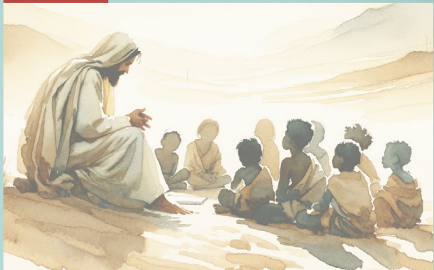
Jesus Blesses the Children [Matthew 19:13-15]