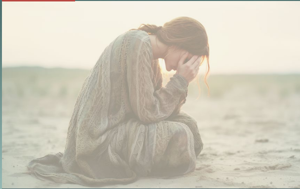
Hagar and Ishmael in the Desert [Genesis 21:8-21]