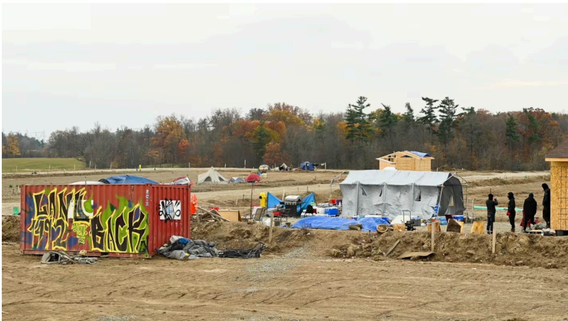
People camp out at a construction site at the centre of a land dispute in Caledonia, Ont., on Thursday, October 29, 2020.