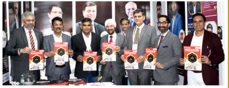
— Scenes From Our Last Events —

Artificial Intelligence, Machine Learning & Digital technologies are the need of today. Integrating these with the existing systems will surely bring a sea change in the overall performance of all industrial units whether small or large in the PSU or private sector industries.