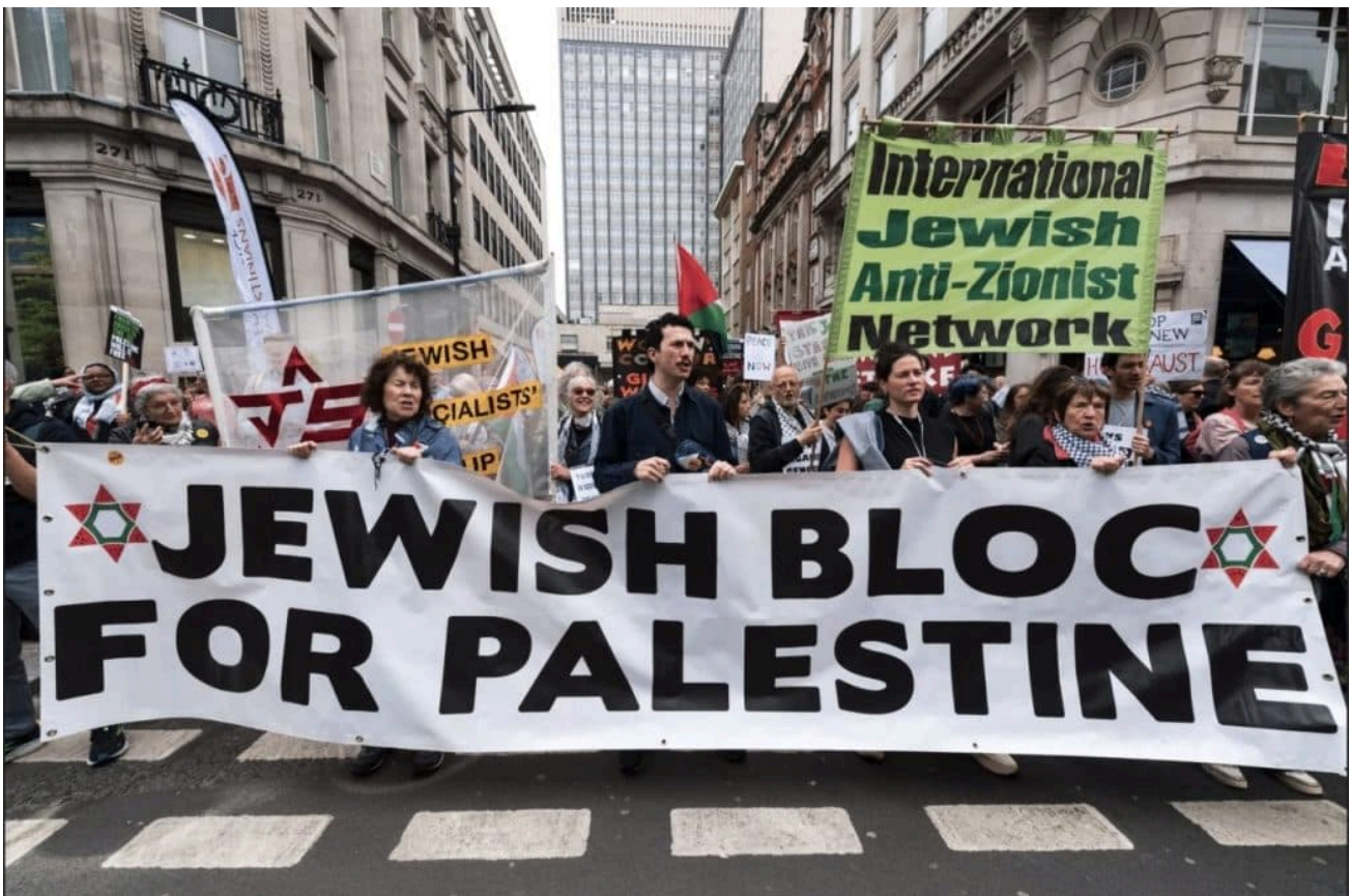
PROTESTORS CARRY A BANNER READING, "JEWISH BLOC FOR PALESTINE" AT THE FRONT OF A MARCH.

Anti-Zionism is as old as political Zionism. Both movements were born in the same year, 1896. One was a small movement, started by a Viennese journalist, Theodor Herzl, while the other was a mass movement of Jewish workers in Eastern Europe and Russia – the Socialist Labour Bund. While the Bund became a large movement in several East European countries – in Poland, for example, it was the second largest party in the Sejm, the Polish Parliament – Zionism represented less than 1% of the Jewish population in Europe. During the great period of Jewish emigration out of Eastern Europe starting in 1881, millions of Jews immigrated to North and South America, Britain, South Africa, and Australia. During the same period, a few thousand Zionist Jews immigrated to Palestine.