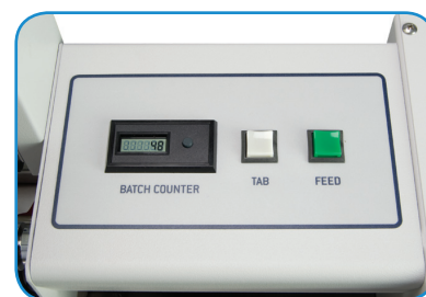
Simple, push-button controls and resettable LCD counter