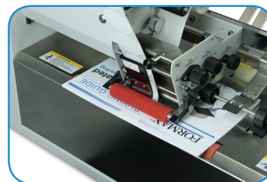
Applicator and rollers ensure tab is tightly folded and sealed