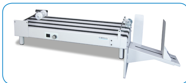
FD 282-30 Drop-Stacking Conveyor