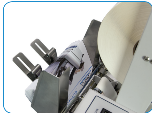
Integrated bottom feed for continuous operation

The Formax FD 262 Single-Head Tabber makes quick work of applying tabs to folded mailpieces, and is designed to meet all USPS requirements for mailing and automation discounts. Using “crash tab” technology, the open edge of a mailpiece contacts an adhesive tab and travels through a set of rollers where the tab is tightly folded and sealed, creating a mail-ready piece.