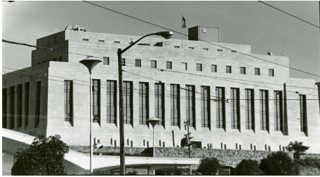
The San Francisco Mint