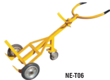
NE-T09 Drum Transportation Trolley