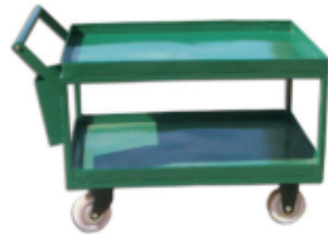
NE-T05 All Purpose Utility Trolley