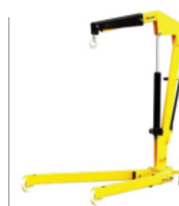
NE-H09 Hydraulic Floor Crane