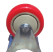
Polyurethane Light Duty Fixed Castor