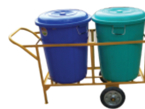
NE-T11 Bucket Trolley