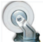
Medium Duty Swivel Castor