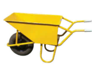
NE-T02 Single Wheel Barrow With Scooter Wheel