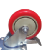
Light Duty Swivel Castor with Foot Brake