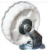
White Polymer Design Type