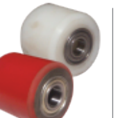
Nylon/Polyurethane Roller with ball bearing