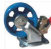
Cast Iron Swivel Castor with Foot Brake