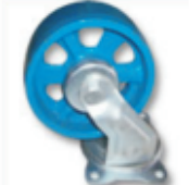
Cast Iron Medium Duty Swivel Castor