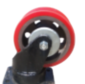
Cast Iron PU coated Forging Swivel Castor