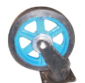
Bonded Rubber Tyre Forging Swivel Castor