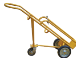
NE-T15 Single Gas Cylinder Trolley - 3 Wheeler