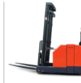
NE-H06 Electric Counter Balance Stacker