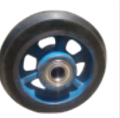
Bonded Rubber Tyre Wheel