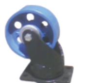
Cast Iron Forging Swivel Castor