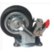
Solid Rubber Tyre Swivel Castor with Foot Brake