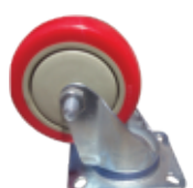
Polyurethane Light Duty Swivel Castor