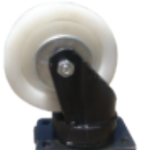
White Polymer Forging Swivel Castor