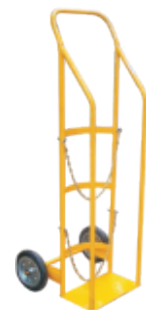
NE-T14 Single Gas Cylinder Trolley - 2 Wheeler