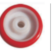
Polyurethane On White Polymer Wheel