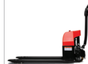
NE-H02 Electric Pallet Truck (DC Power)