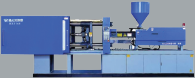
Injection Molding Machine

As the enterprise serves wholeheartedly for the domestic and foreign customers "NATRAJ" is willing to move forward hand in hand with you, create excellence together and enjoy a brilliant relationship with you.