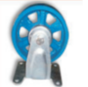
Cast Iron Medium Duty Fixed Castor