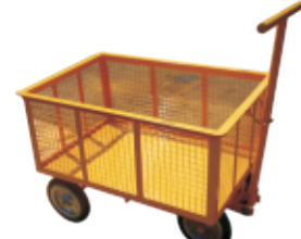
NE-T03 Workshop Trolley Pulling Type