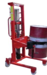
NE-H04 Hydraulic Drum Lifter Cum Tilter