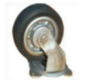
Solid Rubber Tyre Swivel Castor