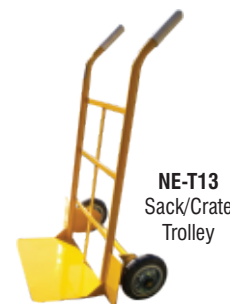
NE-T16 Sack/Crate Trolley