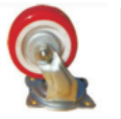
Polyurethane Medium Duty Swivel Castor