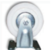
Medium Duty Fixed Castor