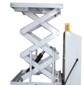
Scissor Table (DC)