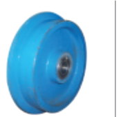
Cast Iron Flange Wheel