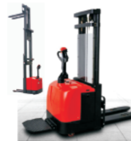
NE-H07 Fully Automatic Battery Stacker