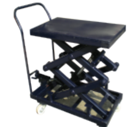
Hydraulic Scissor Lift - Manual