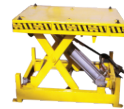
Scissor Table (AC)