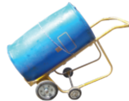
NE-T10 Drum Handling & Tilting Trolley