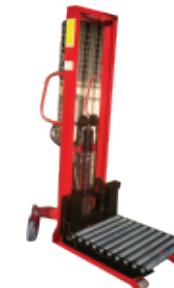
NE-H05 Hydraulic Stacker with Roller Platform