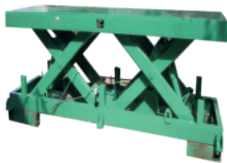
Heavy Duty Scissor Table