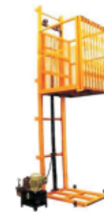
NE-H08 Goods Lift