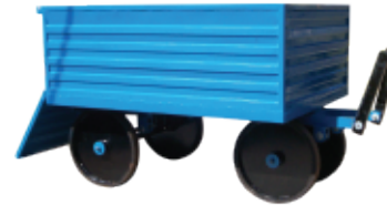
NE-T08 Trailer with BRT wheel