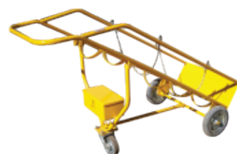
NE-T13 Double Gas Cylinder Trolley with tool box