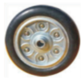
Solid Rubber Tyre Round Shape Wheel