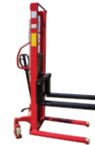
NE-H03 Manual Hydraulic Stacker