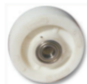
White Polymer 'I' Shape Wheel with Ball Bearing