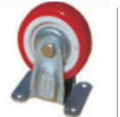
Polyurethane Medium Duty Fixed Wheel