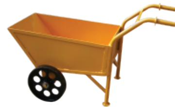
NE-T01 Double Wheel Barrow

Mechanical Trolleys & Trailors (Trolleys can be made as per customer requirement)