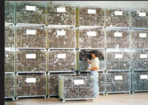
Metal Wire Pallet