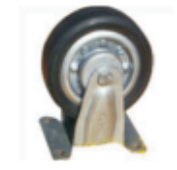
Solid Rubber Tyre Flat Shape Fixed Castor