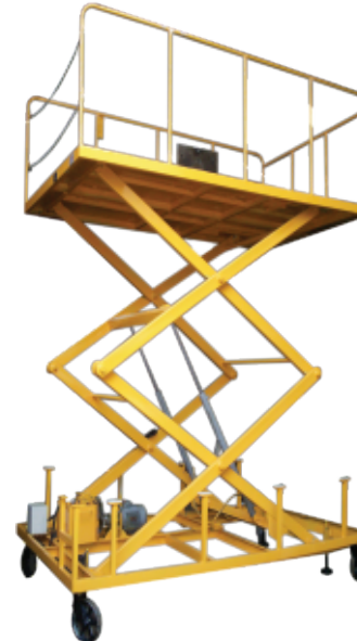
Electro-Hydraulic Scissor Lift Table (AC)

(Scissor Lifts can be made as per customer requirement)