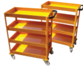
NE-T06 Tool Kit Trolley