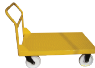
NE-T04 Platform Trolley