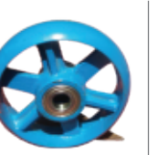
Half Round Shape Cast Iron Wheel