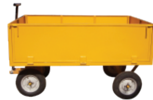
NE-T12 Trailer with Scooter wheel