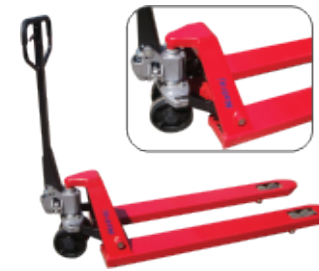
NE-H01 Hydraulic Hand Pallet Truck