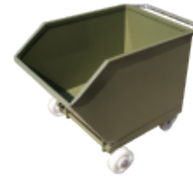
NE-T07 Chip Collection Tilting Type Trolley