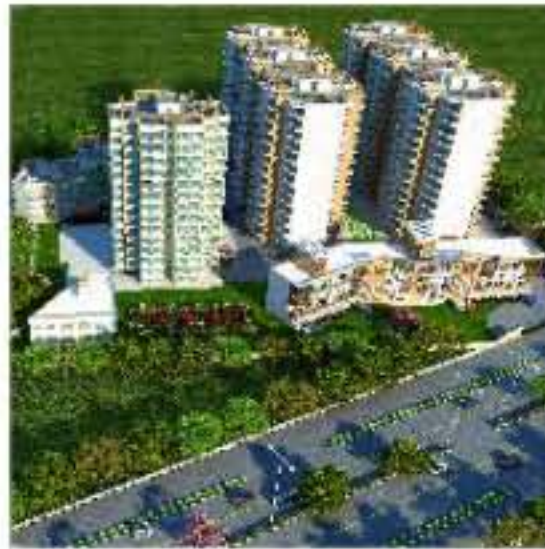
Pyramid : Urban Homes II, Sector 86, Gurugram