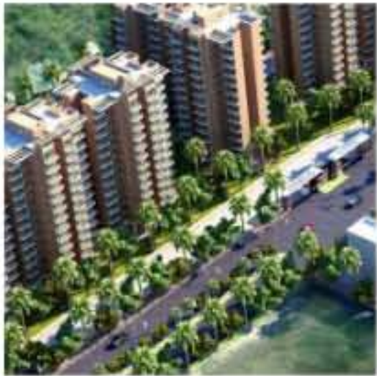
Pyramid : Urban Homes Sector 70A, Gurugram

PYRAMID has marked its footprints in real estate segment within a very short time-span demonstrating its construction quality, innovation, customer satisfaction and on time project implementation of its on-going affordable housing projects situated at Sector 70A, Sector 86 and Sector 67A at Gurugram, Haryana. The motto of the company is "Quality, Timely Delivery & Excellence". The Group believes in holistic development of society - a society that's forward thinking yet deeply rooted in values, morals and traditions. We strive to deliver equal and quality access to affordable living. That's why we align our business interests seamlessly with social initiatives to propel India towards the prosperous future.