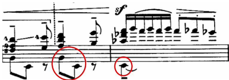
1) Bars 86-87 (Alternative)

With 7=C, we can play the G and C one octave lower.