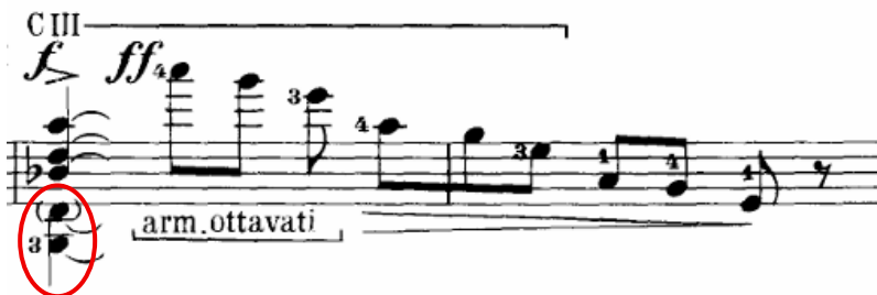
3) Tempo I : bars 105-106 (alternative)

By playing these notes one octave lower, with 6=D and 8=G, it allows them to not be cut during the rest of the bar.