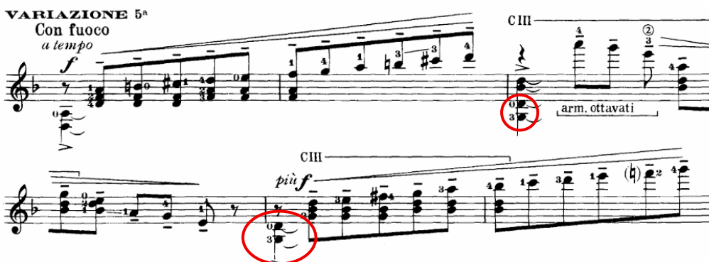
2) Variation V : bars 82-87 (alternative)

By playing these notes one octave lower, with 6=D and 8=G, it allows them to not be cut during the rest of the bar.