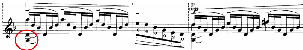
1) Variation I : bars 17-19 (alternative)

By playing these notes one octave lower, with 6=D and 8=G, it allows them to not be cut during the rest of the bar.